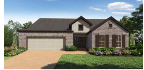
Elevation B Floorplan