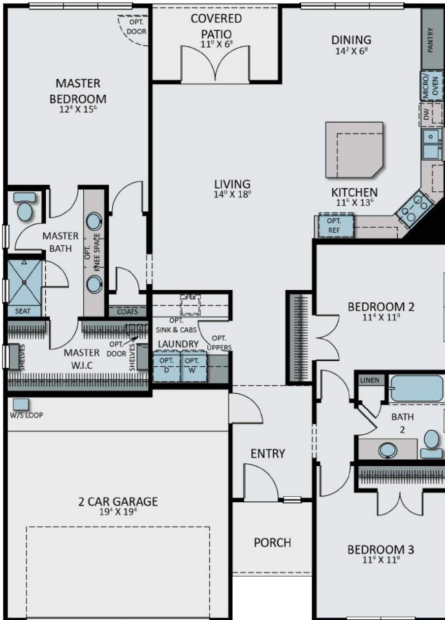
Elevation A Floorplan