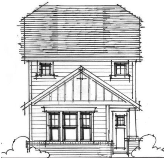
ELEVATION - B Craftsman