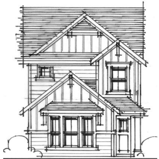
ELEVATION - C Farmhouse