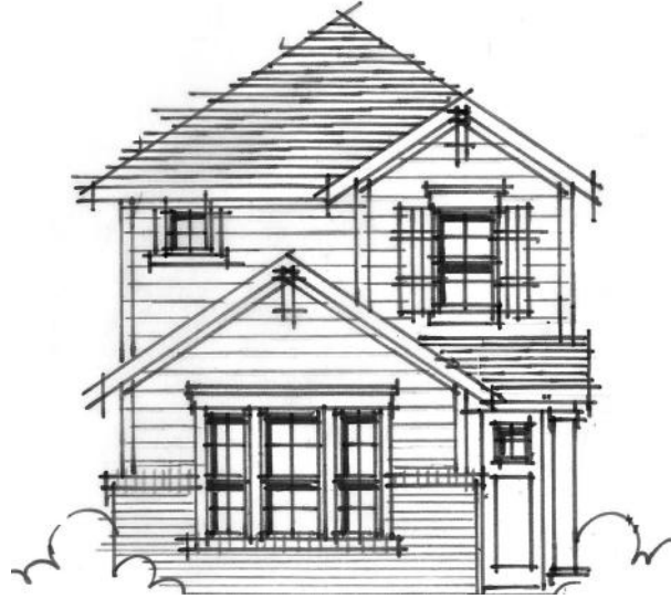
ELEVATION - A Cottage