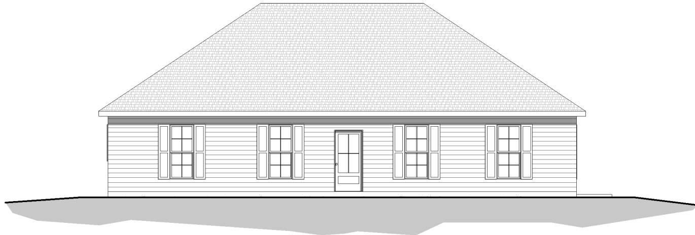
FRONT ELEVATION 9'-1" PLATE HEIGHT - 9' CLG. 10:12 ROOF PITCH