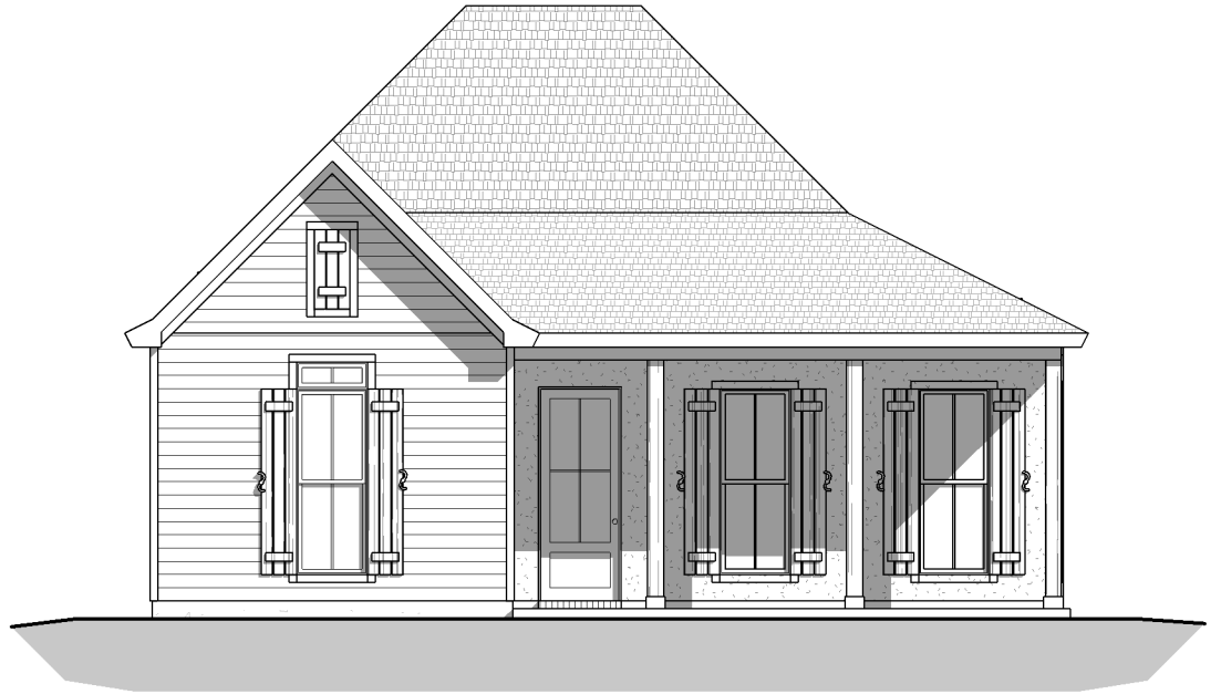
FRONT ELEVATION 10'-1" PLATE HEIGHT - 10' CLG. HT. 6:12; 12:12 ROOF PITCH