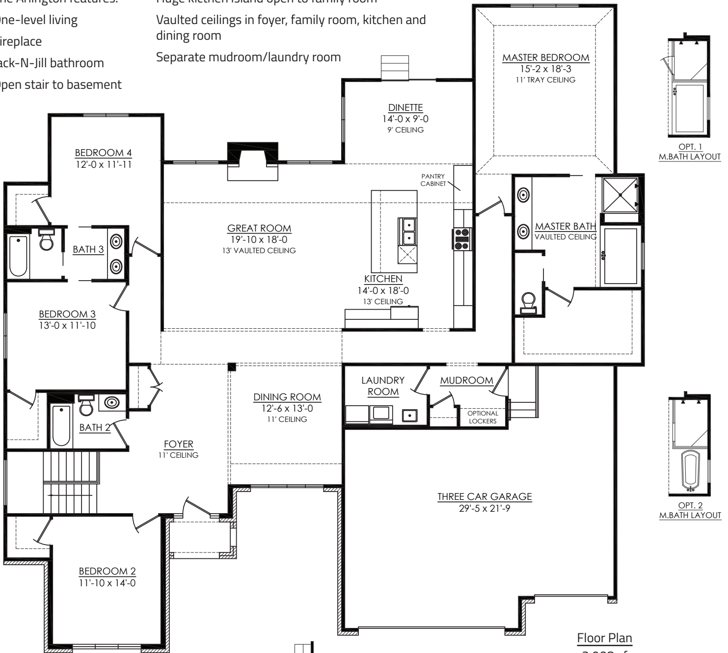
Floor Plan 2,908 sf

Huge kitchen island open to family room Vaulted ceilings in foyer, family room, kitchen and dining room Separate mudroom/laundry room