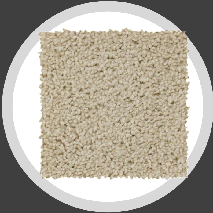
CARPET – TRADITION