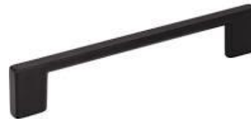
CABINET HARDWARE- SUTTON MATTE BLACK