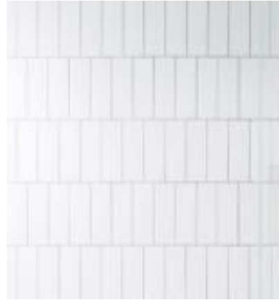
SHOWER WALL – 3X6 WHITE VERTICAL STRAIGHT STACK