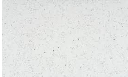
COUNTERTOP – STAR CLUSTER