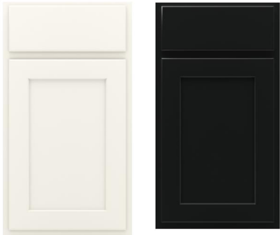
ARBOR CABINETS - ALPINE (UPPERS) + ONYX (LOWERS)