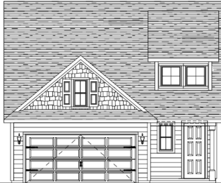
FRONT ELEVATION C