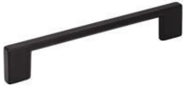
CABINET HARDWARE- SUTTON BLACK