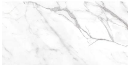
FLOOR –CALACATTA EMPIRE 12X24 - OFFSET PATTERN