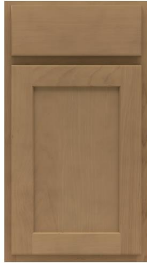
CABINETS – FALLOW