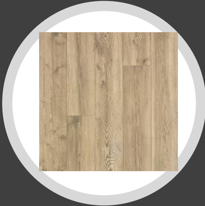
HARDWOOD – CANVAS OAK