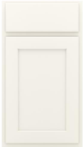
CABINETS – ALPINE