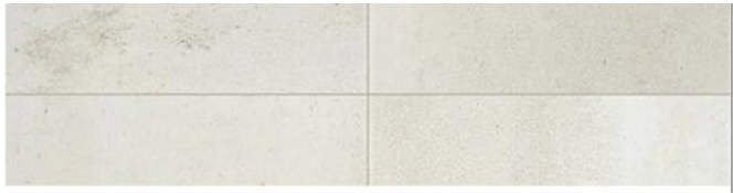
BACKSPLASH -OFFSET -3X12 MODERN HEARTH