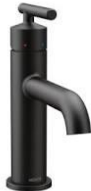
GIBSON SINGLE FAUCET BLACK