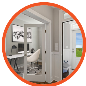
Pocket Office / Delivery Center

What makes a newly constructed home special is the quality and value it provides, from the functionality of the floorplan to what's behind the walls. Layers of innovative materials and unique features make your new home invaluable.