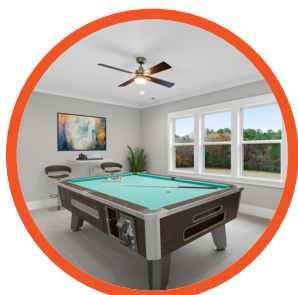
Flexible Living Space

Since working, learning, and staying fit and healthy from home are here to stay, why not choose a home that offers a private workspace or work-out space.