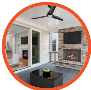
Outdoor Living Space

Zero-entry shower? Spa bath? Two walk-in closets? Direct access to the laundry room? A sitting room? Done & done! Pick the layout that best fits your needs.