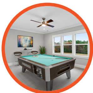
Flexible Living Space

Since working, learning, and staying fit and healthy from home are here to stay, why not choose a home that offers a private workspace or work-out space.