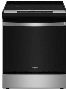
Electric Range: WSIS5030RZ

(*Requires Tile Matrix Selection For Backsplash To Ceiling Per Tile Level )