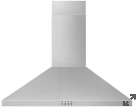
Hood Vent: WVW53UC0LS

30" Chimney Wall Mount Range Hood 3-Speed, 400CFM Motor Class, LED Task Lighting - Includes Exterior Venting