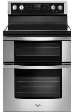
Electric Range: WGE745C0FS

Whirlpool 1.9 cu. Ft. Smart Over-The-Range with Scan-to-Cook Technology and Convection Cooking Setting