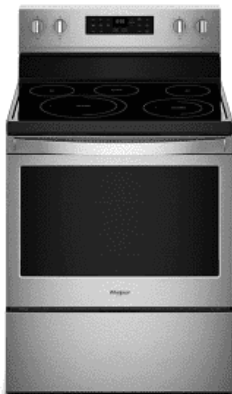
Electric Range: WFE550S0LZ

Whirlpool 1.9 cu. Ft. Smart Over-The-Range with Scan-to-Cook Technology and Convection Cooking Setting