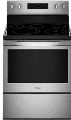
Electric Range: WFE550S0LZ

Whirlpool 1.9 cu. Ft. Smart Over-The-Range with Scan-to-Cook Technology and Convection Cooking Setting