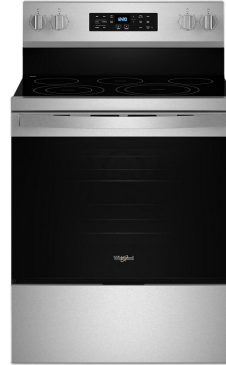
Electric Range: WFES5030RZ

Whirlpool 1.9 Cu. Ft. Steam Microwave with Sensor Cooking