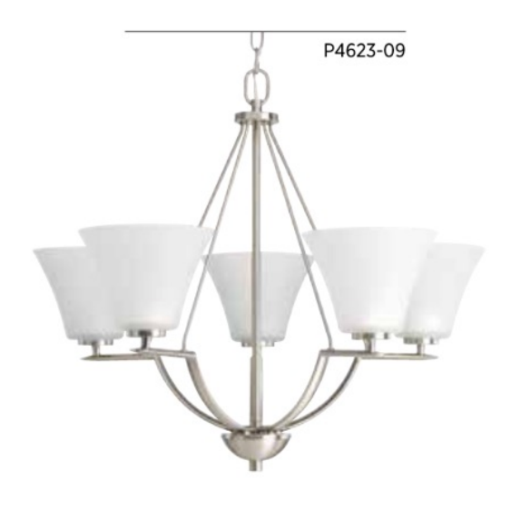
DINING ROOM P4623-09 Brushed Nickel 27" dia., 23" ht., Overall ht. w/chain 97", wire 12'. Five medium base lamps, each 100w max.