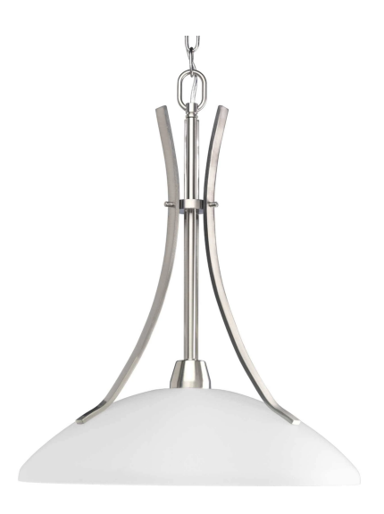
2 STORY FOYER P5112-09 Brushed Nickel 17" dia., 21.31" ht. 1 medium base, 100w max.