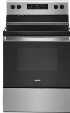
Electric Range: WFES3530RS

Whirlpool 1.7 cu. Ft. Microwave Hood Combination with Electronic Touch Controls