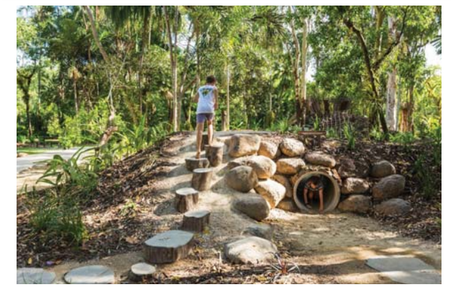
1 Nature Playground