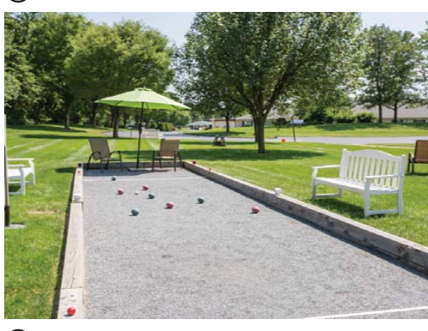
3 Bocce Court