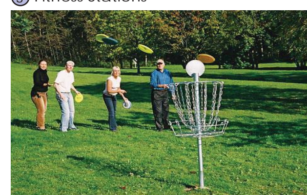
4 Disc Golf