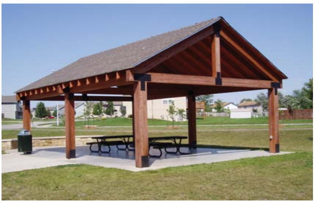
2 Event Pavilion