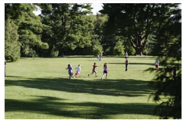
1) Multiuse Activity Lawn