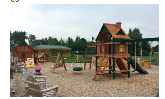
4 Play Area