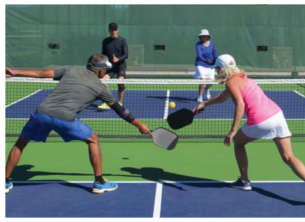
(3) Pickle Ball Court