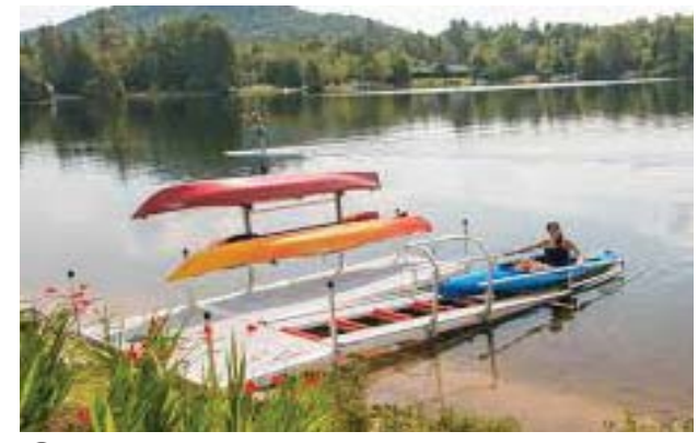
2 Kayak Launch