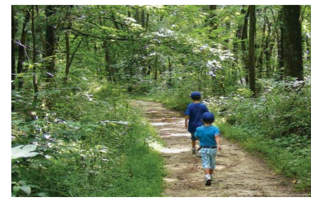
2 Wooded Hiking Trails Trails