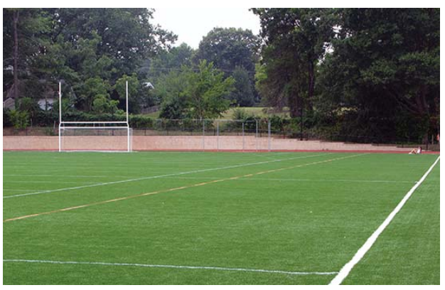
2 Multi-Use Fields