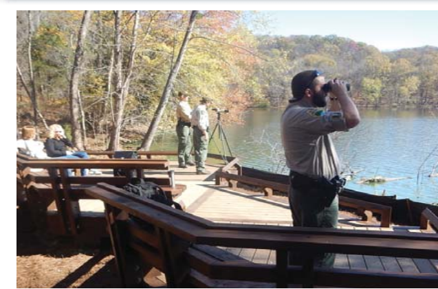
1) Observation Deck