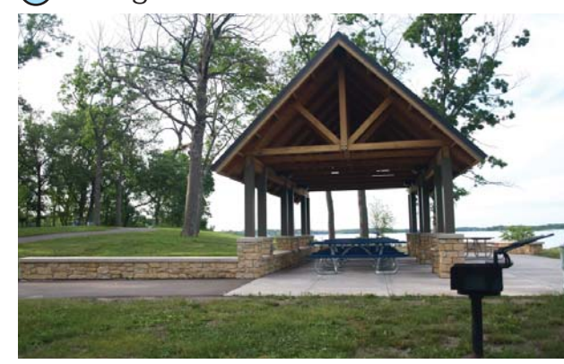
4 Picnic Pavillion