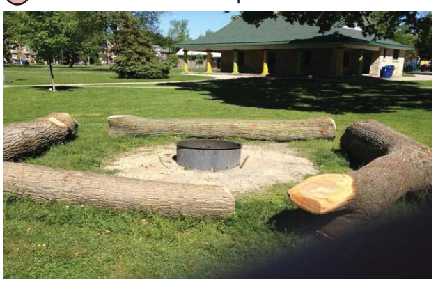
4 Fire Pit