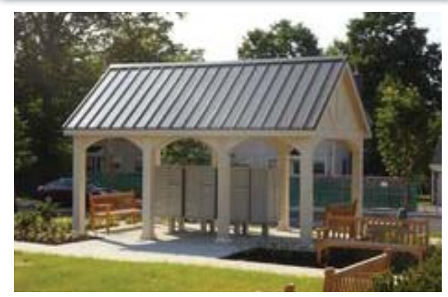
1 Entrance and Mail Kiosk