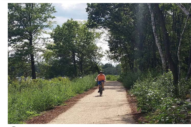
1 Multiuse Trails