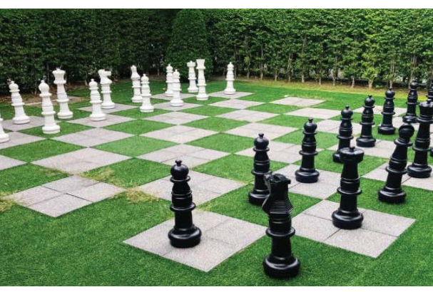
② Life-Sized Lawn Chess