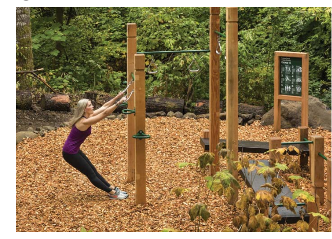
3 Fitness Stations