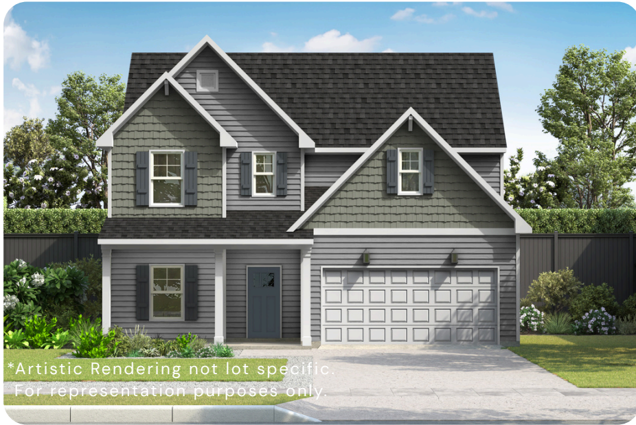
*Artistic Rendering not lot specific. For representation purposes only.

2,058 SQFT | 3 BR | 2.5 BA | 2 CAR GARAGE