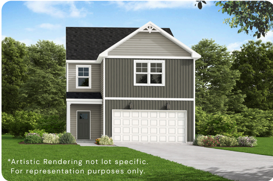
*Artistic Rendering not lot specific. For representation purposes only.