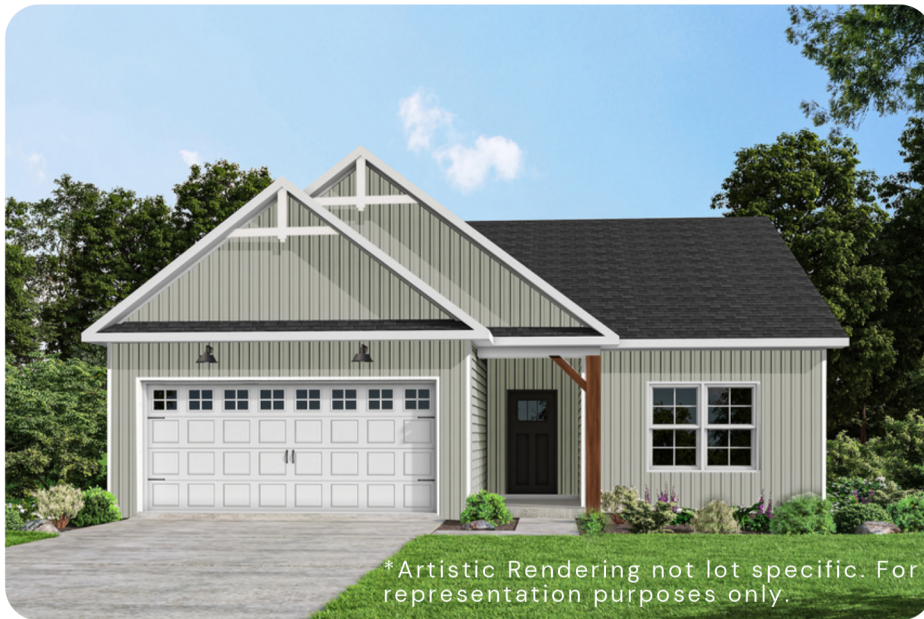
*Artistic Rendering not lot specific. For representation purposes only.