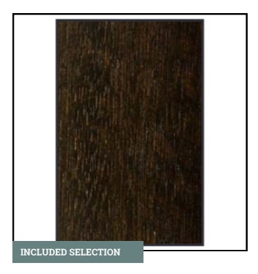
FRONT DOOR COLOR

Mahogany 5-Lite Contemporary | Clear Glass