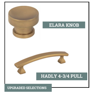
CABINET HARDWARE Satin Bronze Knobs Style 484SBZ | Pull Style 449-96SBZ