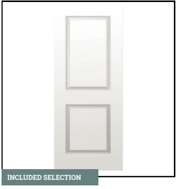
INTERIOR DOOR STYLE