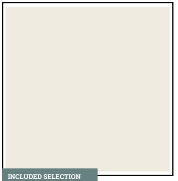
INTERIOR TRIM PAINT