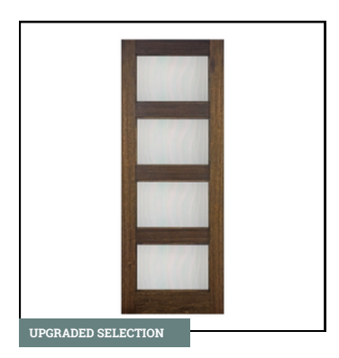
FRONT DOOR STYLE

Mahogany 5-Lite Contemporary | Clear Glass