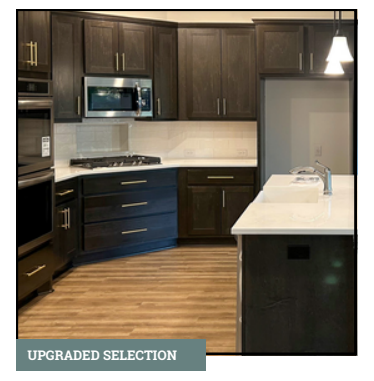
CABINETS Door Style: Groveland Color: Grey Wolf