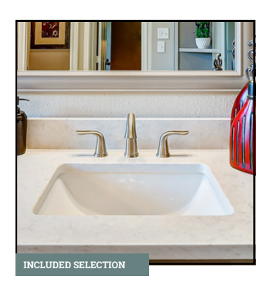
BATHROOM SINKS Rectangle Undermount Sink