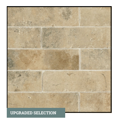
KITCHEN BACKSPLASH 4" x 8" Ceramic Tile in BW02 Atrium | Recommended Grout Color: Driftwood