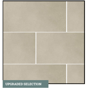
SHOWER WALL TILE 12" x 24" Ceramic Tile in VL74 Reverb Ash | Recommended Grout Color: Ivory