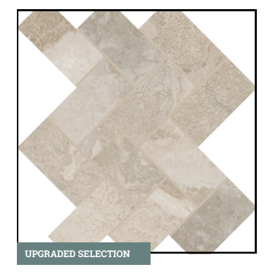
SHOWER FLOOR TILE 1" x 3" Herringbone Ceramic Tile in 0709(2) Matte Architectural Gray | Recommended Grout Color: Ivory