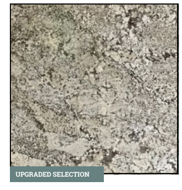
COUNTERTOPS Granite with Beveled Edge Color Name: Zanzibar