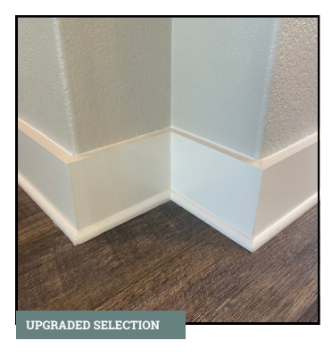
INTERIOR TRIM LEVEL