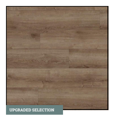
FLOORING Luxury Vinyl Plank Color: Copano Oak #1003