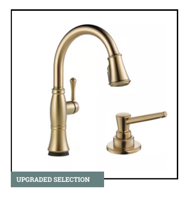
KITCHEN FAUCET Cassidy 9197-CZ-PR-DST Champagne Bronze