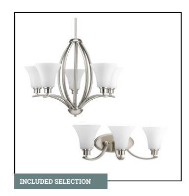
LIGHTING Joy Collection | Brushed Nickel