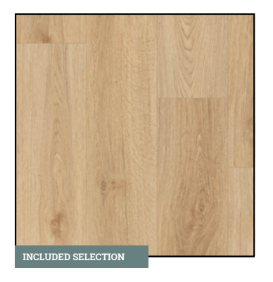
FLOORING Luxury Vinyl Plank Color: Springfield Oak #1020