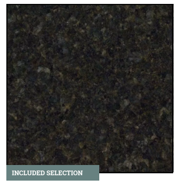
COUNTERTOPS Granite with Demi Bullnose Edge Color Name: Uba Tuba