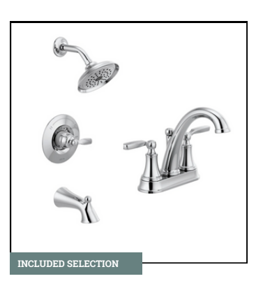
BATHROOM PLUMBING Woodhurst Collection | Chrome