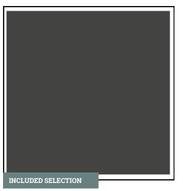
INTERIOR TRIM PAINT