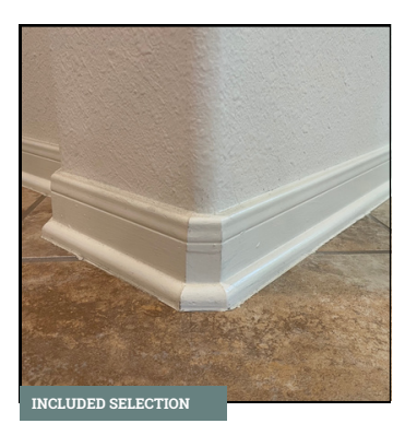
INTERIOR TRIM LEVEL