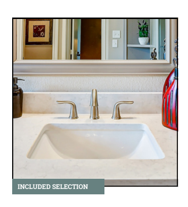
BATHROOM SINKS Rectangle Undermount Sink