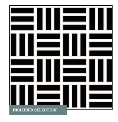
SHOWER FLOOR TILE 1" x 3" Lattice Ceramic Tile in K711(2) Matte Black | Recommended Grout Color: Sahara Beige