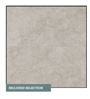
KITCHEN BACKSPLASH 12" x 12" Ceramic Tile in AR05 Casper | Recommended Grout Color: Sahara Beige