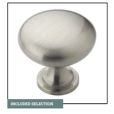
CABINET HARDWARE Satin Nickel Knobs Style 3910SN