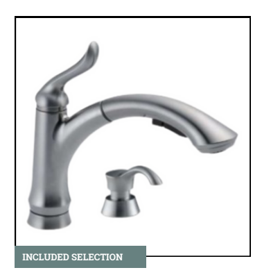
KITCHEN FAUCET Linden 4353-AR-DST | Arctic Stainless