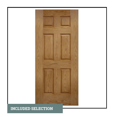
FRONT DOOR STYLE