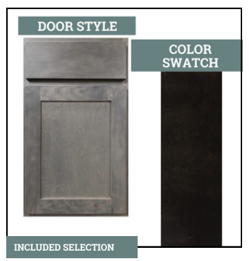
CABINETS Door Style: Groveland Color: Espresso