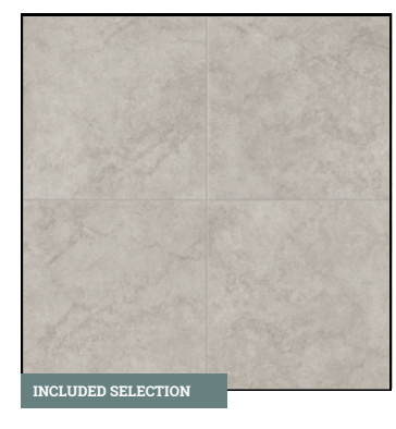
SHOWER WALL TILE 12" x 12" Ceramic Tile in AR05 Casper | Recommended Grout Color: Sahara Beige