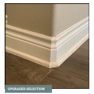
INTERIOR TRIM LEVEL Upgraded Wide Base 6" Baseboard

Options shown are for illustrative purposes only. Tilson continuously improves home designs and reserves the right to modify home features and specifications without notice or obligation. Tilson included features may vary by home design or location. Contact a Tilson Design Consultant for details.