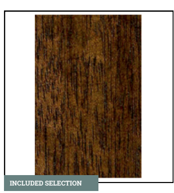
FRONT DOOR COLOR Jacobean Stain