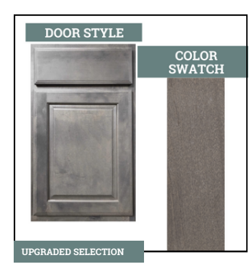
CABINETS Door Style: American Color: Stormcloud Stain