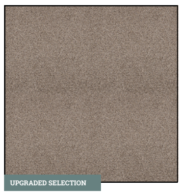
CARPET Grand Isle 101 Weathered