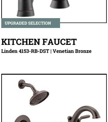
Linden 4153-RB-DST | Venetian Bronze