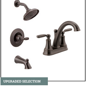
BATHROOM PLUMBING Woodhurst Collection | Venetian Bronze