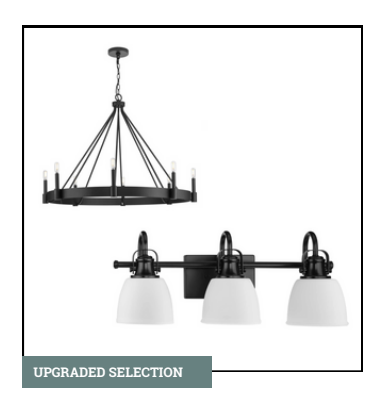
LIGHTING Breckenridge Collection | Matte Black