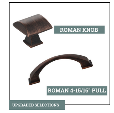
CABINET HARDWARE Brushed Oil Rubbed Bronze Knobs Style 944DBAC | Pull Style 944-96DBAC