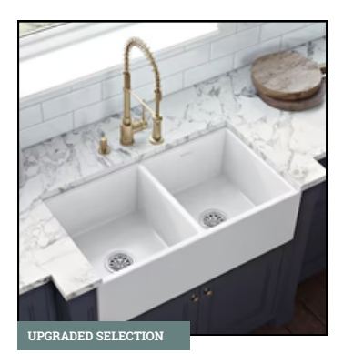
KITCHEN SINK Double Basin White Farmhouse Sink