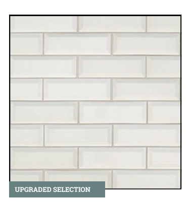
KITCHEN BACKSPLASH 3" x 12" Ceramic Tile in MM30 Spirit | Recommended Grout Color: Cobblestone