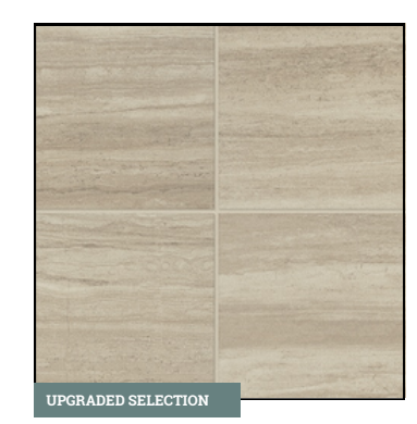
SHOWER WALL TILE 12" x 24" Ceramic Tile in AR07 Feature Beige | Recommended Grout Color: Ivory