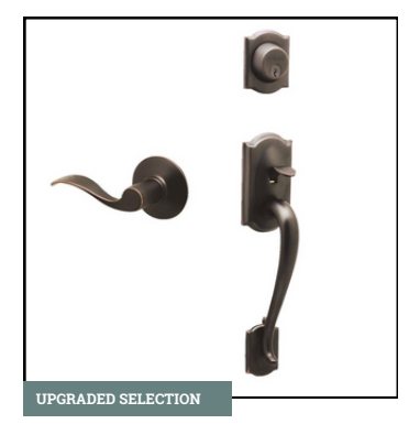
DOOR HARDWARE Accent | Venetian Bronze