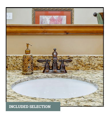
BATHROOM SINKS Oval Undermount Sink