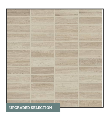
SHOWER FLOOR TILE 1" x 3" Mosaic Ceramic Tile in AR07 Feature Beige | Recommended Grout Color: Ivory