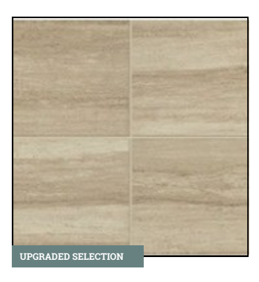
FLOORING 12" x 24" Ceramic Tile in AR07 Feature Beige | Recommended Grout Color: Ivory