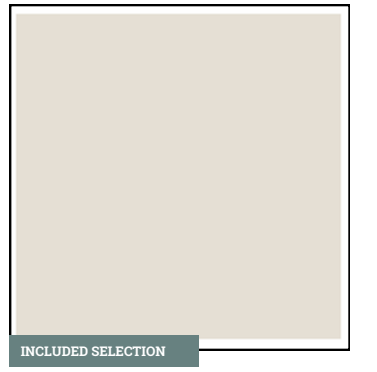
INTERIOR TRIM PAINT SW7042 Shoji White

FRONT DOOR STYLE Iron Grille 3/4 Lite Avignon Knotty Alder | Clear Glass