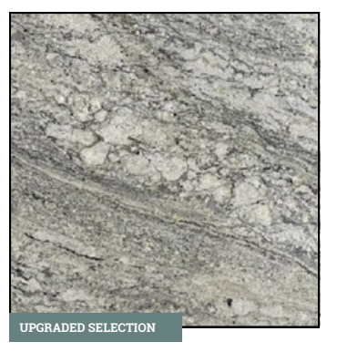
COUNTERTOPS Granite with Demi Bullnose Edge Color Name: Kempton Park

INTERIOR DOOR STYLE 2 Panel Roundtop Plank