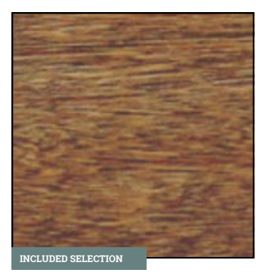
FRONT DOOR COLOR Special Walnut Stain