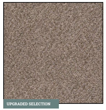
CARPET Fiesta Island 751 Brown Reed