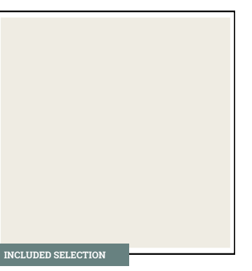
INTERIOR TRIM PAINT SW7551 Greek Villa