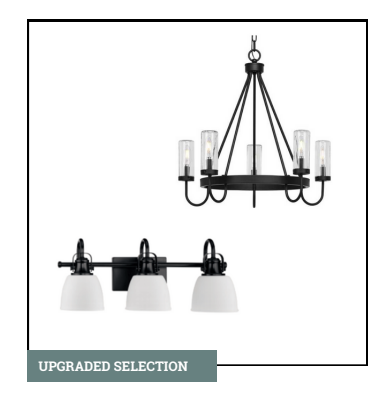
LIGHTING Breckenridge & Swansea Collections | Matte Black