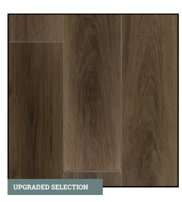
FLOORING 6" x 36" Ceramic Tile in VC04 Brown | Becommended Grout Color: Chocolate