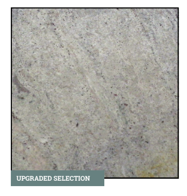
COUNTERTOPS Granite with Beveled Edge Color Name: Cotton White