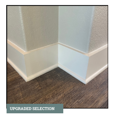
INTERIOR TRIM LEVEL Upgraded 6" Pine Baseboard

Options shown are for illustrative purposes only. Tilson continuously improves home designs and reserves the right to modify home features and specifications without notice or obligation. Tilson included features may vary by home design or location. Contact a Tilson Design Consultant for details.