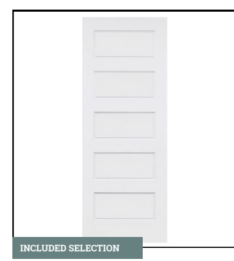
INTERIOR DOOR STYLE 5 Panel Smooth