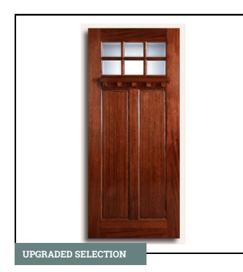
FRONT DOOR STYLE Mahogany Craftsman | Clear Glass