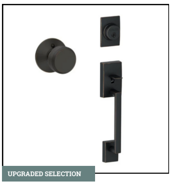
DOOR HARDWARE Bowery with Collins Trim | Aged Bronze Finish