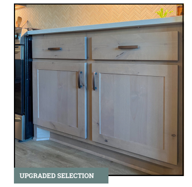
CABINETS Door Style: Groveland Color: Reclaimed Drift