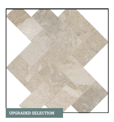
SHOWER FLOOR TILE 2" x 4" Herringbone Ceramic Tile in AR41 Artifact Beige | Recommended Grout Color: Ivory