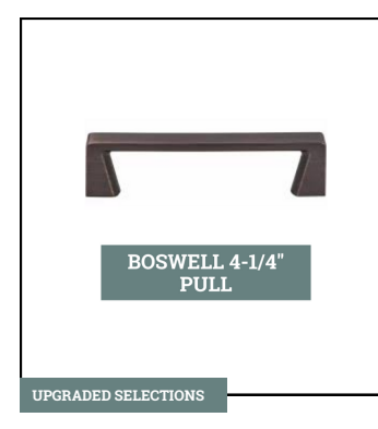
CABINET HARDWARE Brushed Oil Rubbed Bronze Pull Style 177-96DBAC