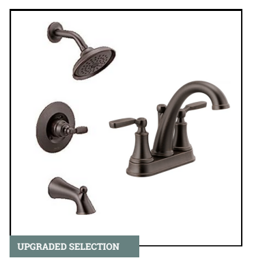
BATHROOM PLUMBING Woodhurst Collection | Venetian Bronze