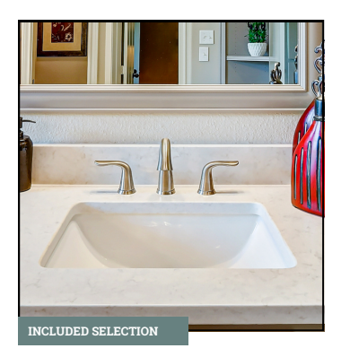
BATHROOM SINKS Rectangle Undermount Sink