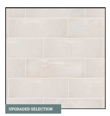
KITCHEN BACKSPLASH 4" x 12" Ceramic Tile in MY91 Olympus | Recommended Grout Color: Ivory