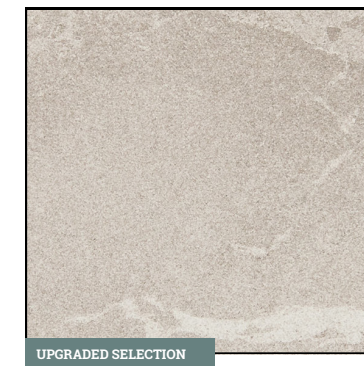
SHOWER WALL TILE 12" x 24" Ceramic Tile in AR41 Artifact Beige Recommended Grout Color: Ivory