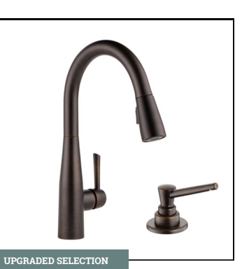
KITCHEN FAUCET Essa 9113-RB-DST Venetian Bronze