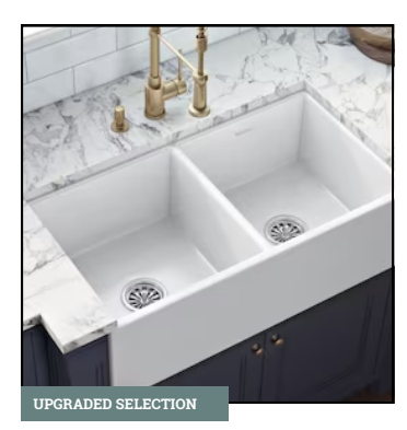
KITCHEN SINK Double Basin White Farmhouse Sink