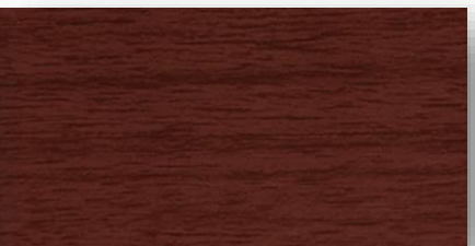
Classic Cherry SW 3110