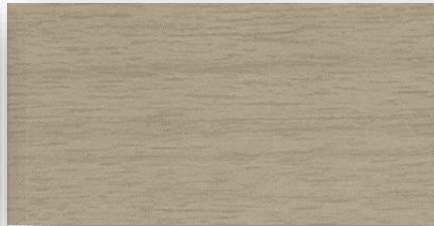
Beechwood SW 3132