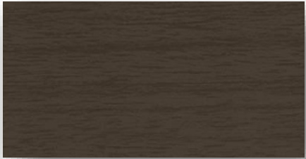
Weathered Teak SW 3134