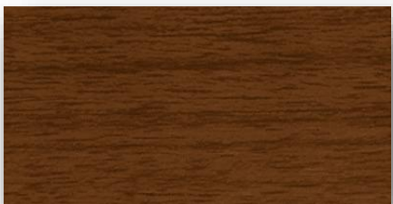
Pecan SW 3124