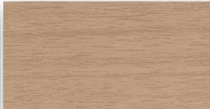
Winter White SW 3131