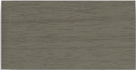
Rustic Gray SW 3133