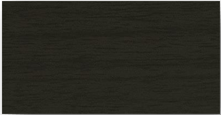
New Ebony SW 3135

*Actual Representation On Physical Material May Look Different Than Digital Picture*