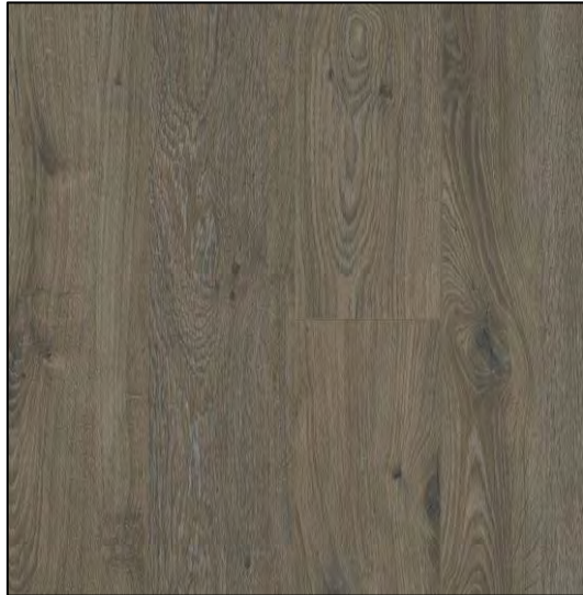
EXCALIBUR PLUS Ashlee Gray