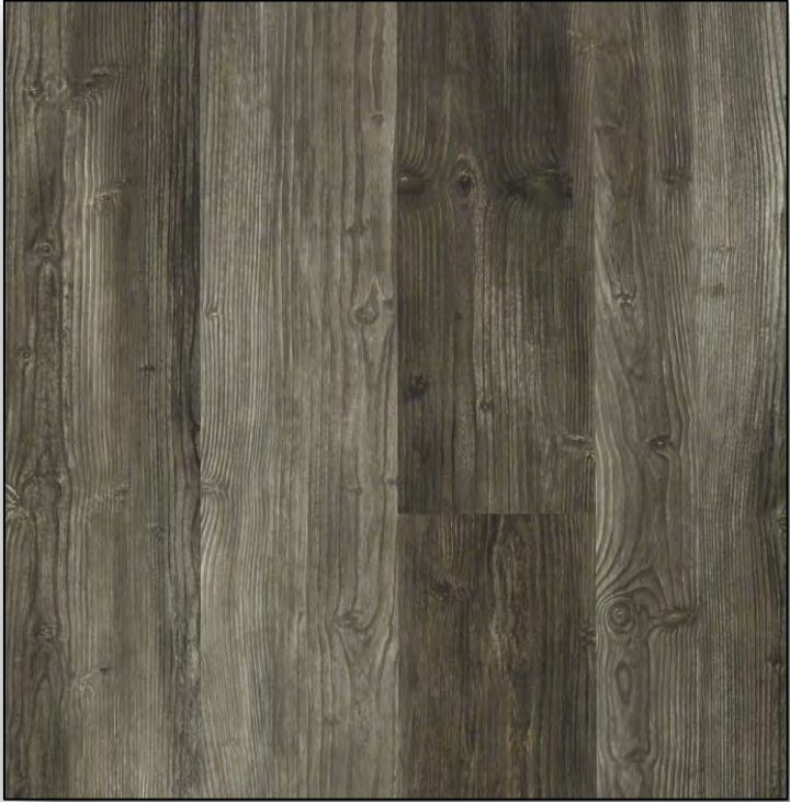
FLOORTE RAVENNA PLUS Harbour Bay *Waterproof*