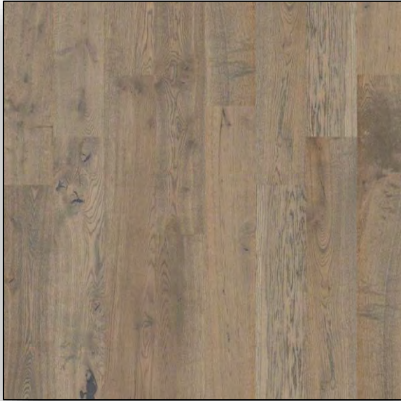
KINGSTON OAK Armory