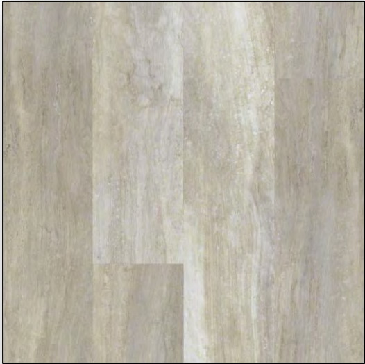
FLOORTE MARVELLA Alabaster Oak *Waterproof*