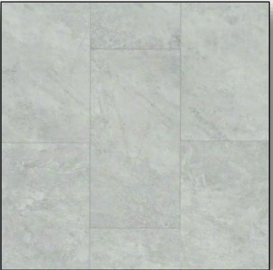
TILE (FAUX) FLOORTE URBAN ORGANICS Pearl *Waterproof*