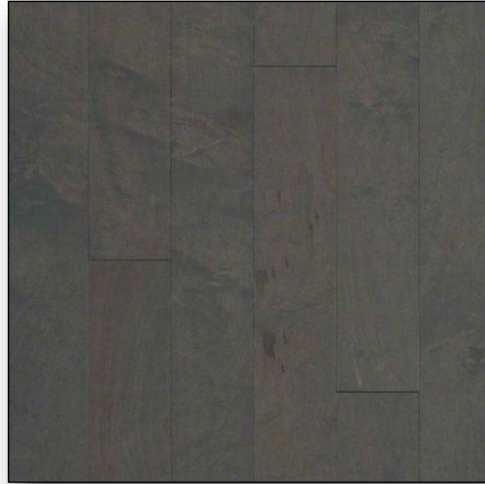
ESSENCE MAPLE Contemporary