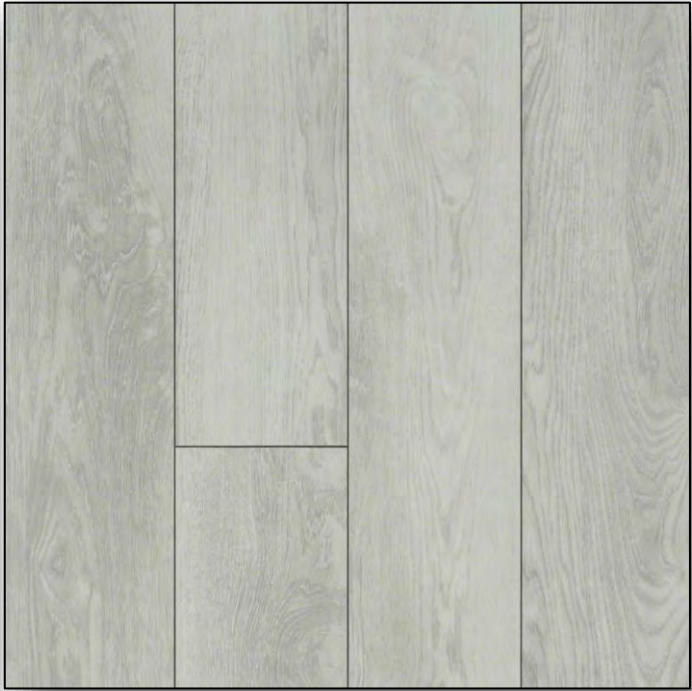
VARIATIONS Cool White