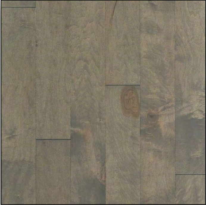
ESSENCE MAPLE Mid Century