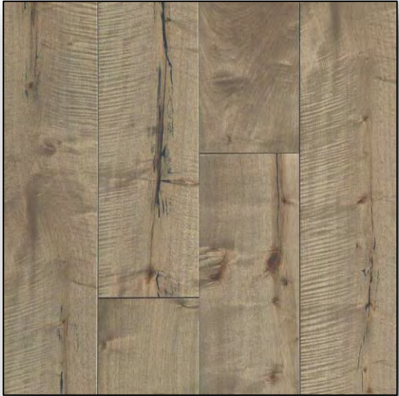
IMPRESSIONS MAPLE Vista