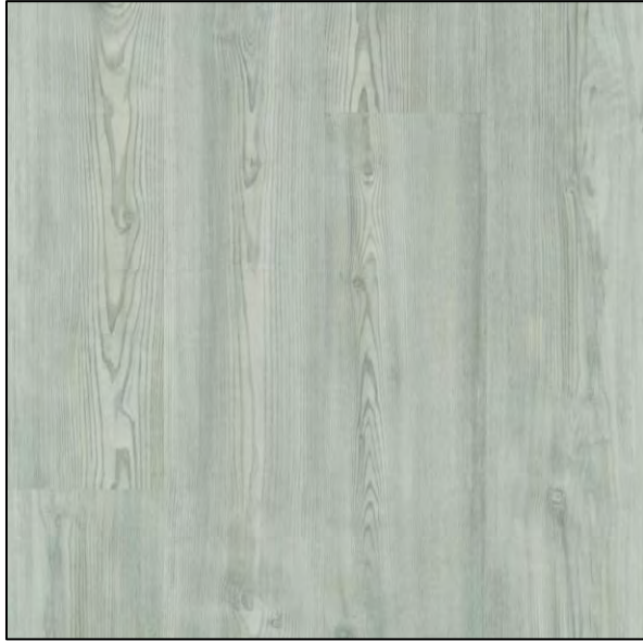
FLOORTE BRIO Clean Pine *Waterproof*