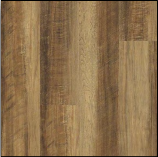
FLOORTE MARVELLA Tawny Oak *Waterproof*