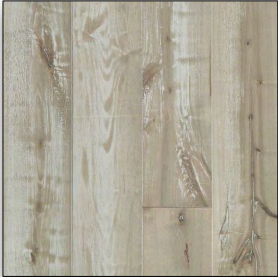
IMPRESSIONS MAPLE Sanctuary