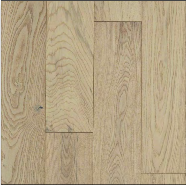
ELEGANCE OAK Champagne