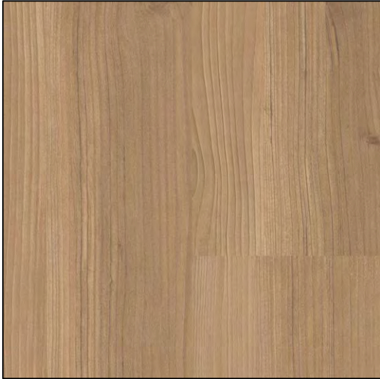
EXCALIBUR PLUS Natural