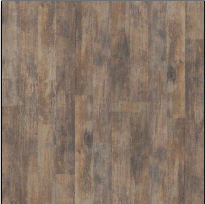
RESTORATION LIVING Weathered Wall