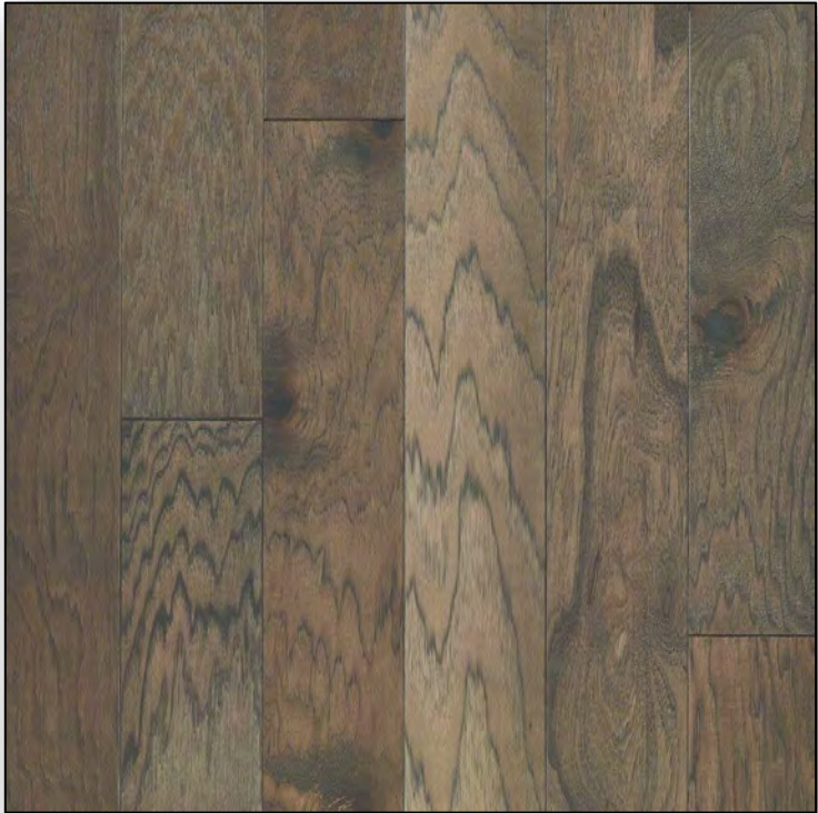
CAMPBELL CREEK BRUSHED Chestnut