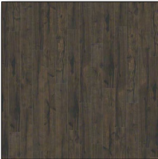
TREASURE COVE Sable Hickory *Repel*