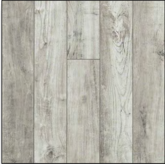
COLUMIBA Wave Crest *Repel*

*Product Availability is Subject to Change