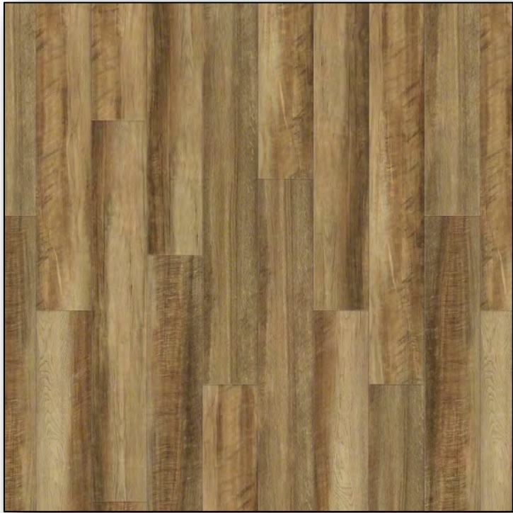
FLOORTE TORINO PLUS Costa *Waterproof*