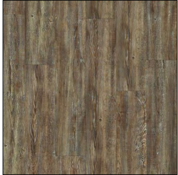
FLOORTE PRESTO Tattered Barnboard *Waterproof*