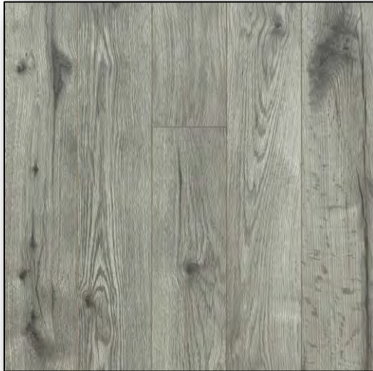
SOUTH BAY Evening Walk *Repel*