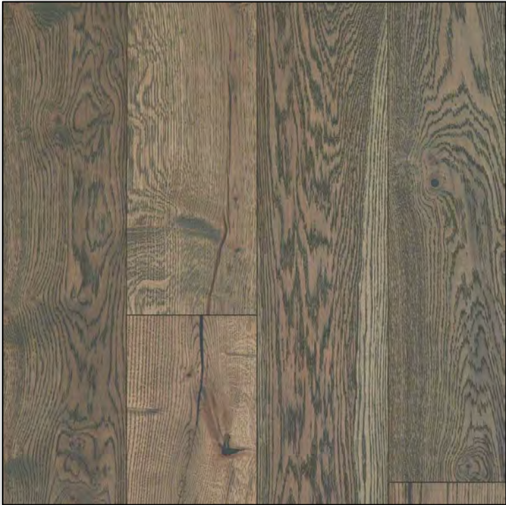
ELEGANCE OAK Crema