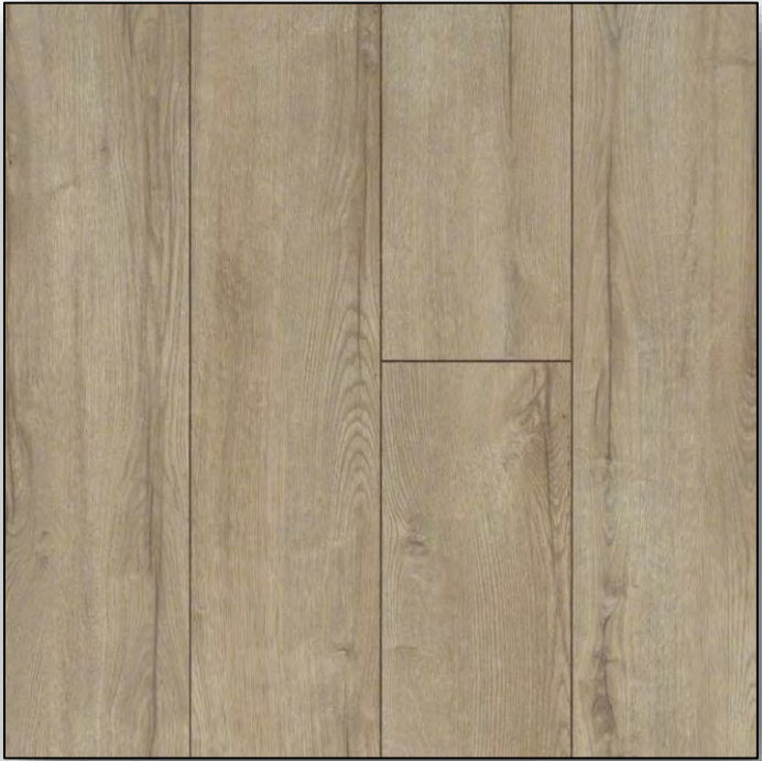
VARIATIONS Light Natural