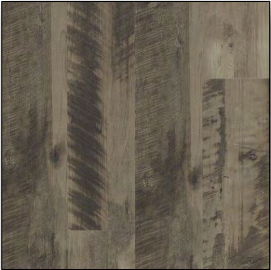
FLOORTE MARVELLA Neutral Oak *Waterproof*