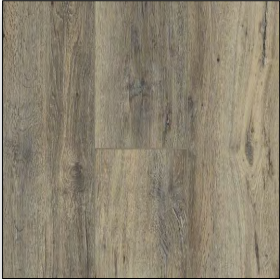
FLOORTE WHITE OAK Sandy Oak *Waterproof*