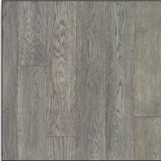
APEX OAK Slate