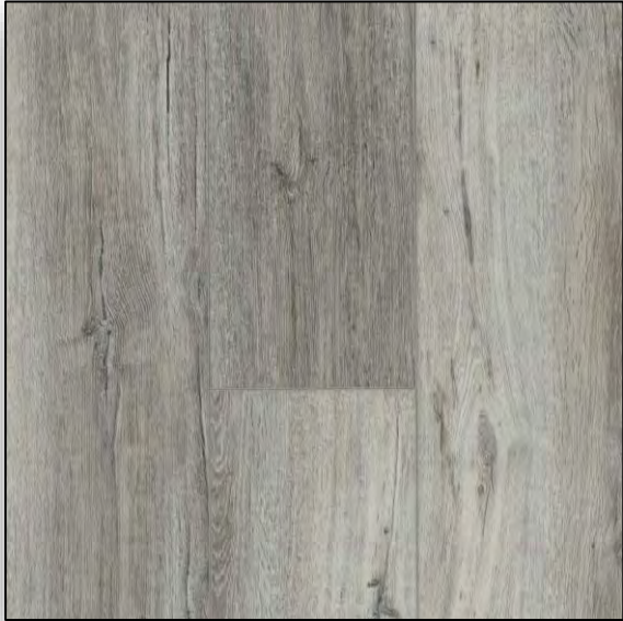
FLOORTE WHITE OAK Wye Oak *Waterproof*