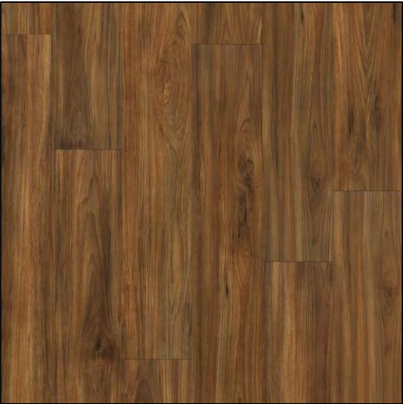
FLOORTE PRESTO Weathered Barn *Waterproof*