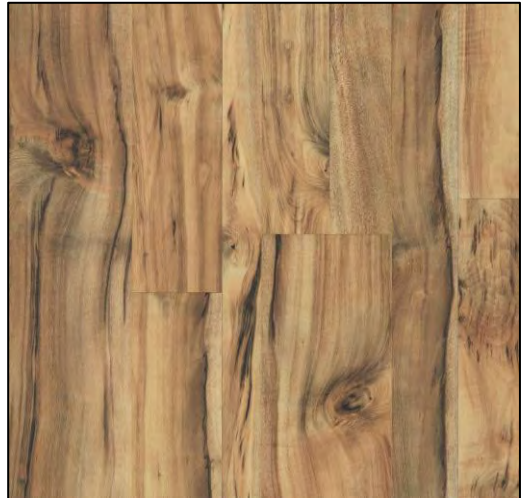
LIVING VIEW Golden Acacia