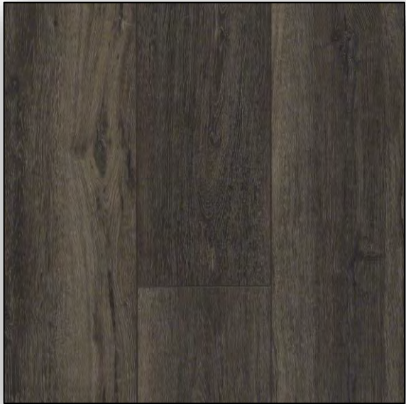
FLOORTE WHITE OAK Bur Oak *Waterproof*