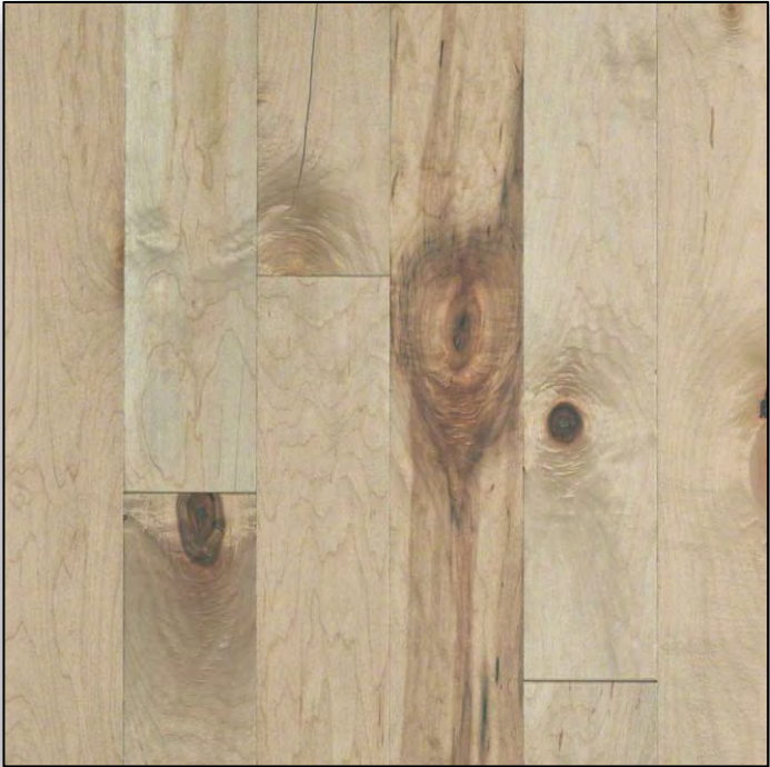
ESSENCE MAPLE Deco