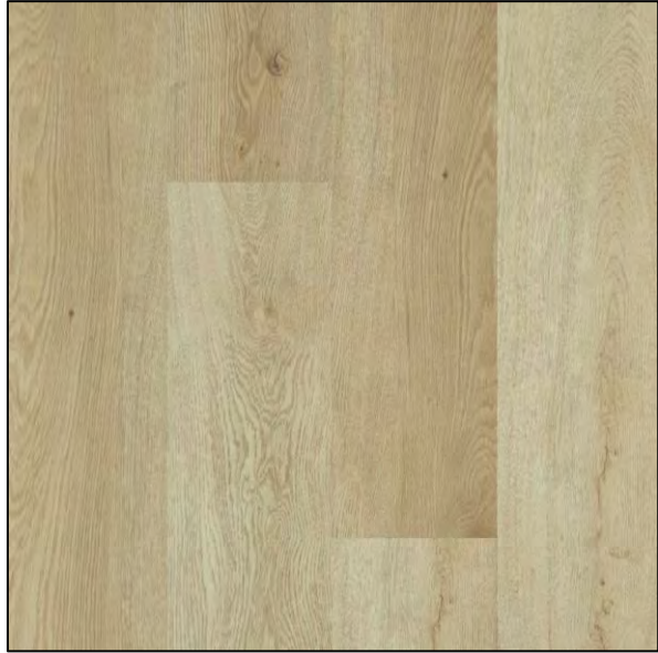
FLOORTE BRIO River Bend Oak *Waterproof*

*Product Availability is Subject to Change