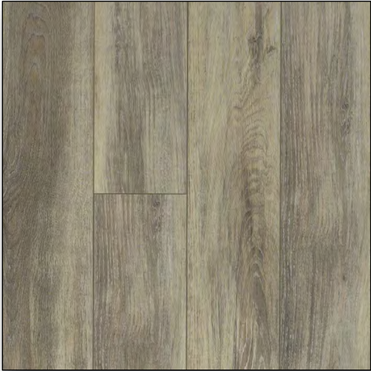
FLOORTE LAZIO PLUS Sabbia *Waterproof*