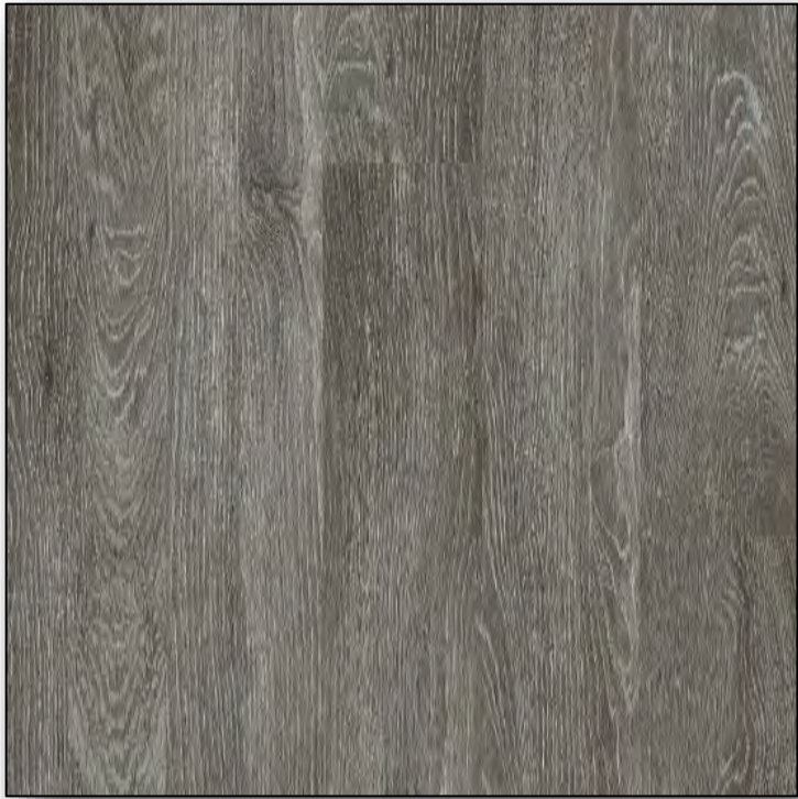
FLOORTE TORINO PLUS Pola *Waterproof*