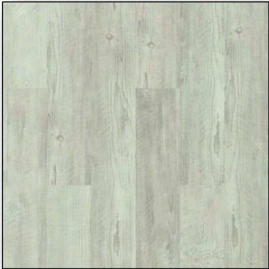
FLOORTE MOONLIT PINE Distressed Pine *Waterproof*

*Product Availability is Subject to Change