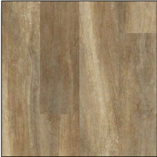
FLOORTE MARVELLA Tan Oak *Waterproof*