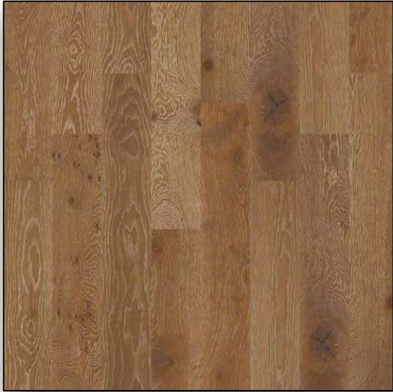
KINGSTON OAK Trestle