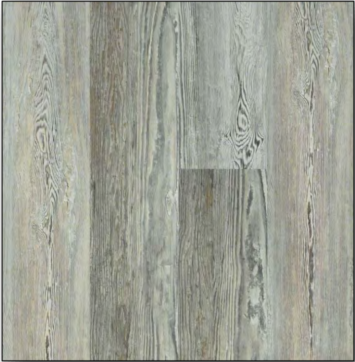
FLOORTE RAVENNA PLUS Ashland Pine *Waterproof*