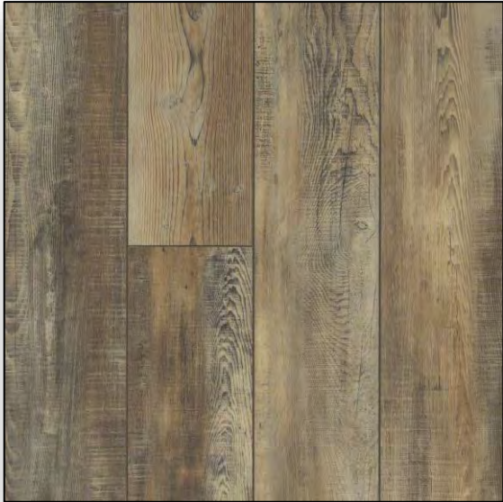
FLOORTE SUPINO HD PLUS Saggio *Waterproof*