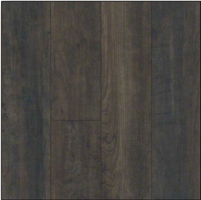
VARIATIONS Mode Brown

*Product Availability is Subject to Change