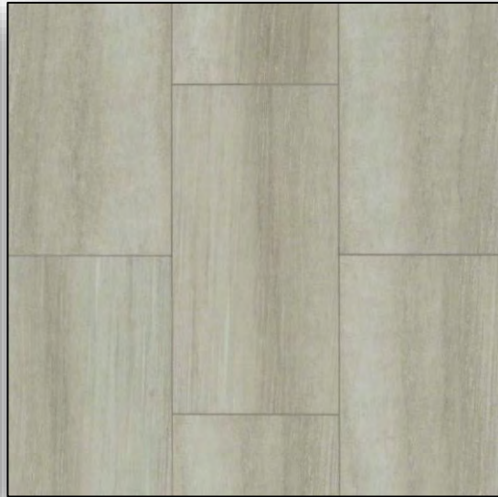
TILE (FAUX) FLOORTE URBAN ORGANICS Ash *Waterproof*