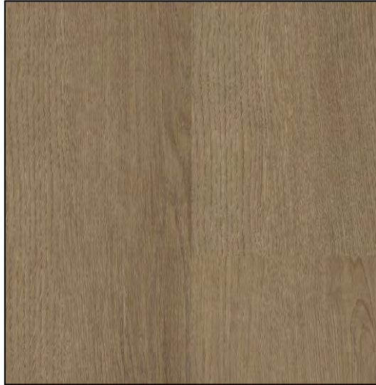
EXCALIBUR PLUS Pure