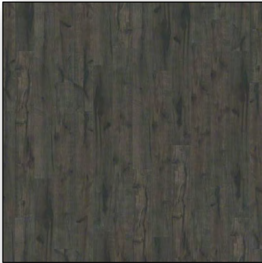
TREASURE COVE Midnight Hickory *Repel*