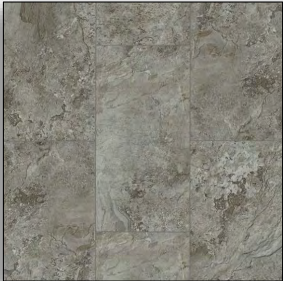
TILE (FAUX) FLOORTE URBAN ORGANICS Slate *Waterproof*