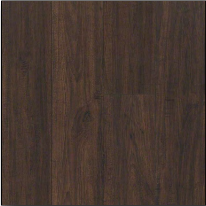
VARIATIONS Dark Umber

*Product Availability is Subject to Change