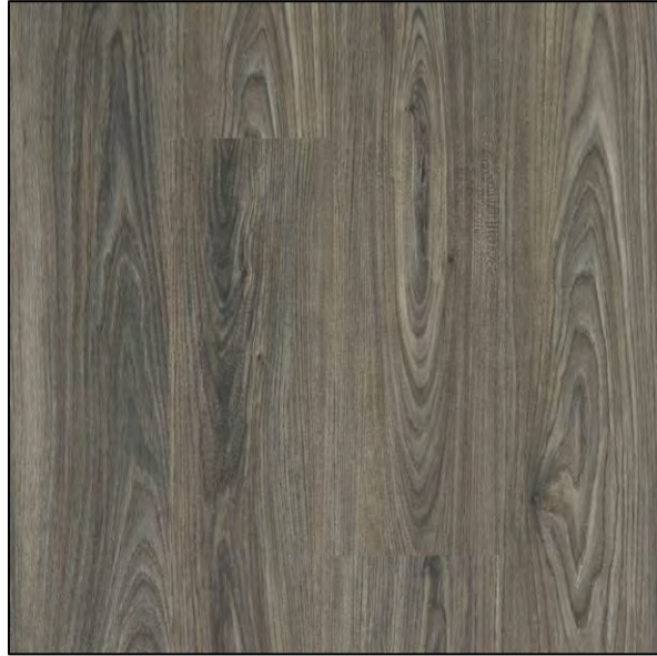
FLOORTE BRIO Dark Elm *Waterproof*