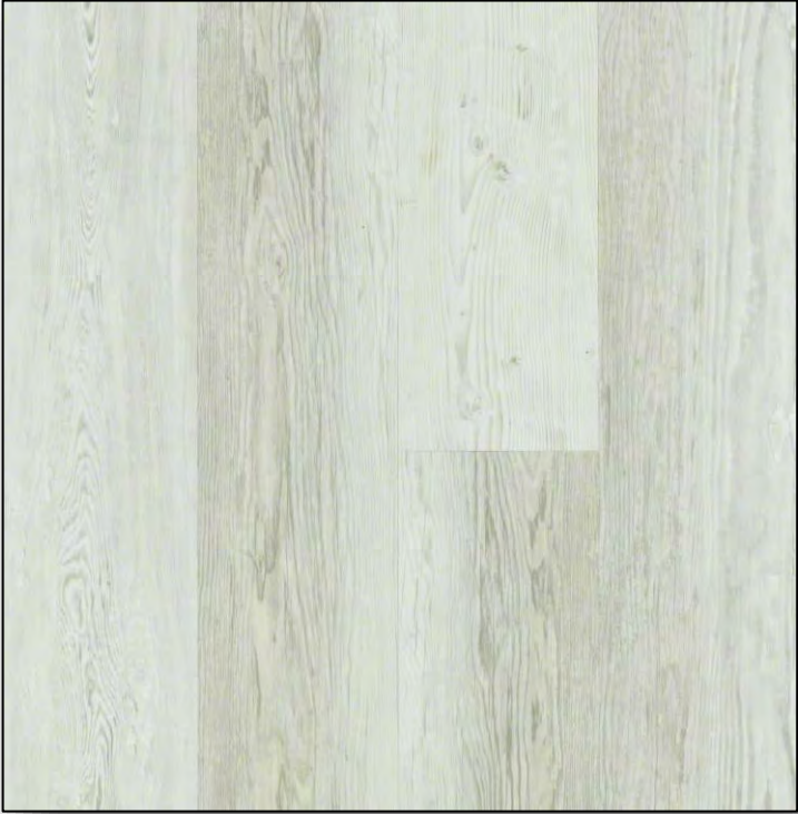
FLOORTE RAVENNA PLUS Century Pine *Waterproof*