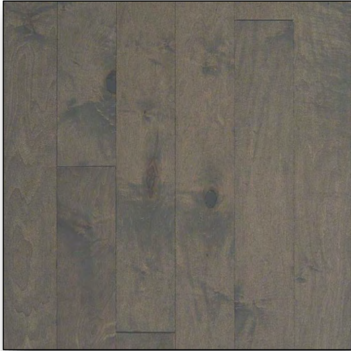
ESSENCE MAPLE Antebellum

*Product Availability is Subject to Change