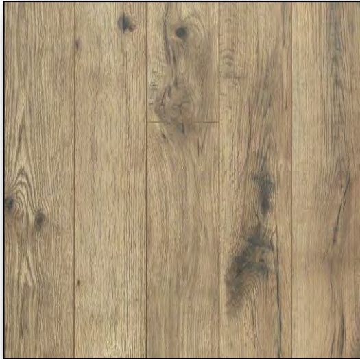
SOUTH BAY Paradise Beige *Repel*