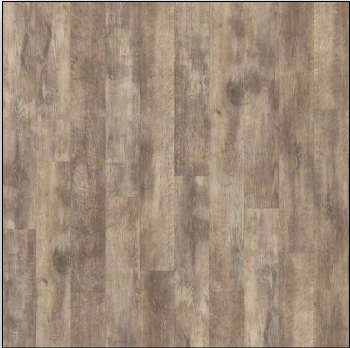
RESTORATION LIVING Weathered Wall