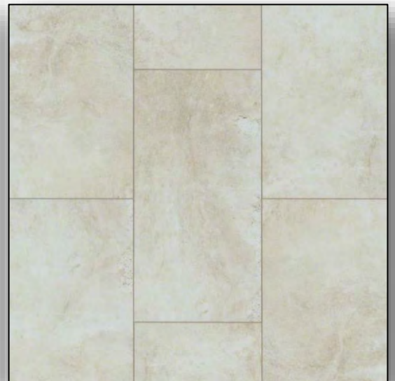
TILE (FAUX) FLOORTE URBAN ORGANICS Shale *Waterproof*