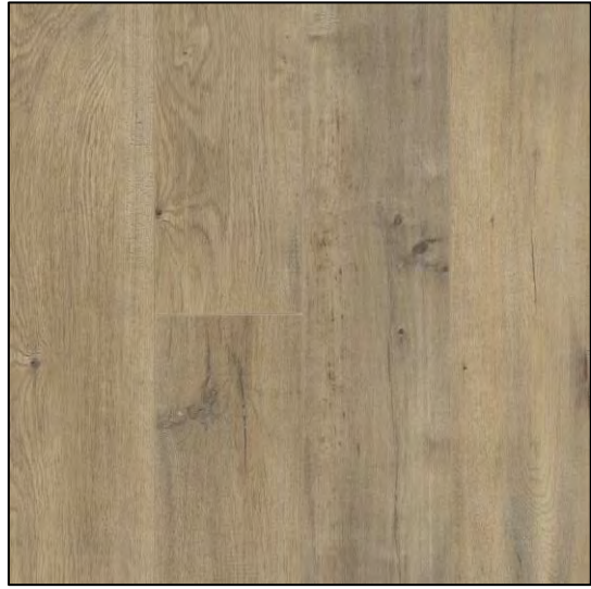
EXCALIBUR PLUS Forge