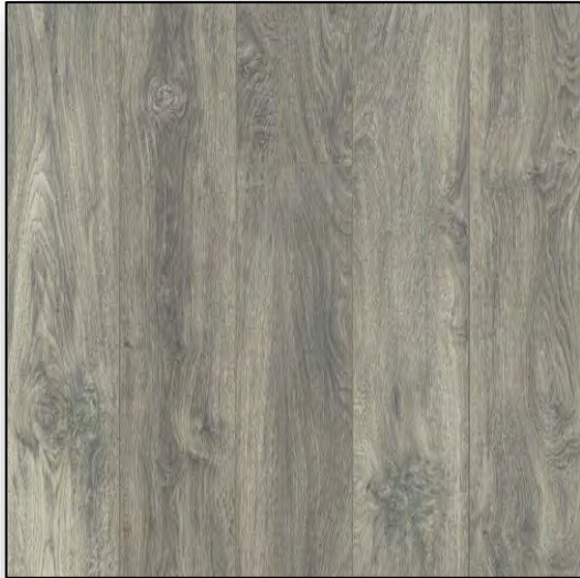
SOUTH BAY Burleigh Taupe *Repel*