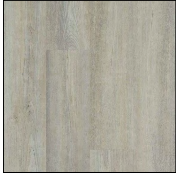
FLOORTE BRIO Greige Walnut *Waterproof*