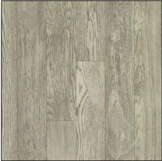
APEX OAK Marble