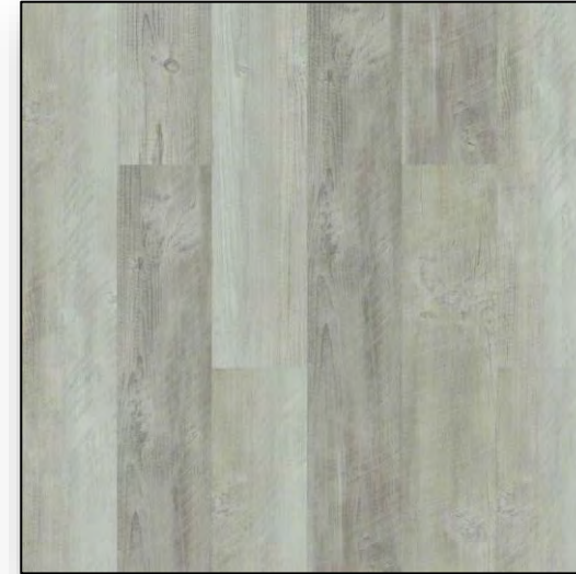
FLOORTE MOONLIT PINE Reclaimed Pine *Waterproof*