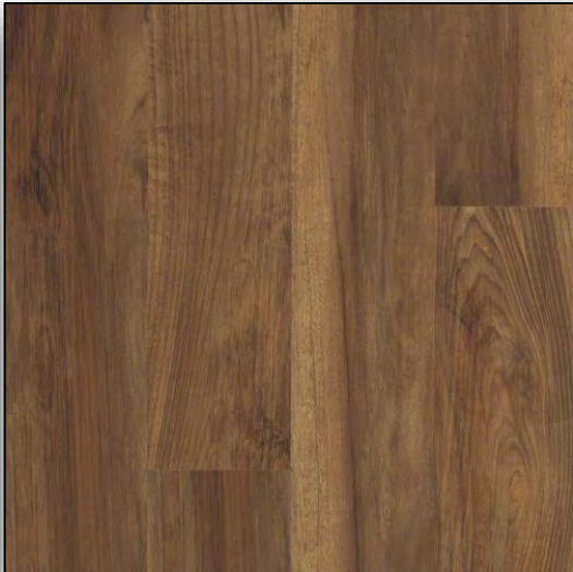
FLOORTE MARVELLA Ginger Oak *Waterproof*