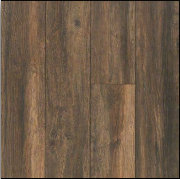
KINGSBAY Hillside Taupe