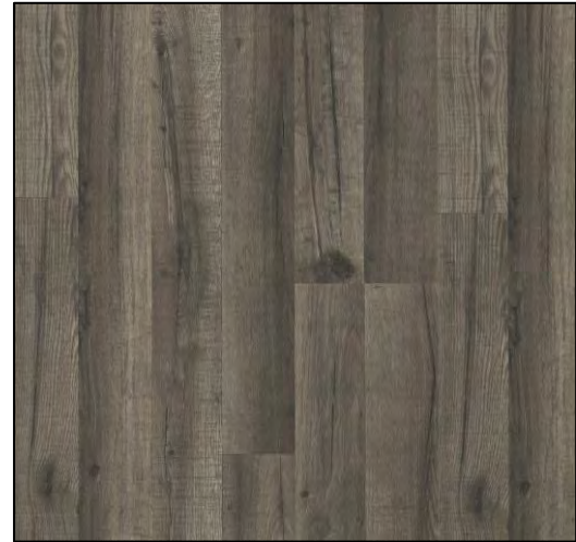
LIVING VIEW Cloudland Oak