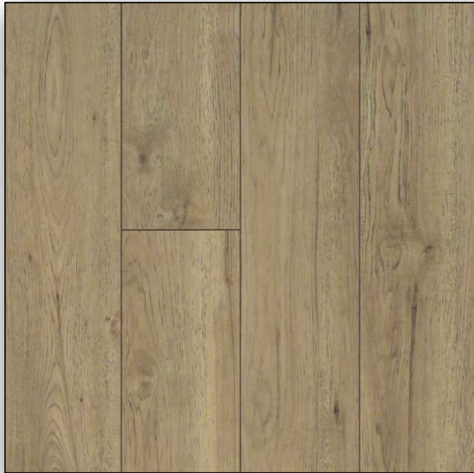
VARIATIONS Golden Sands