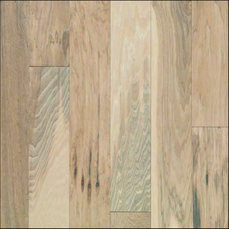
CAMPBELL CREEK BRUSHED Canopy