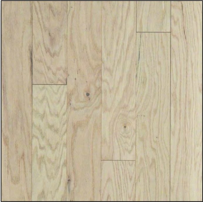
ESSENCE OAK Modern

*Product Availability is Subject to Change