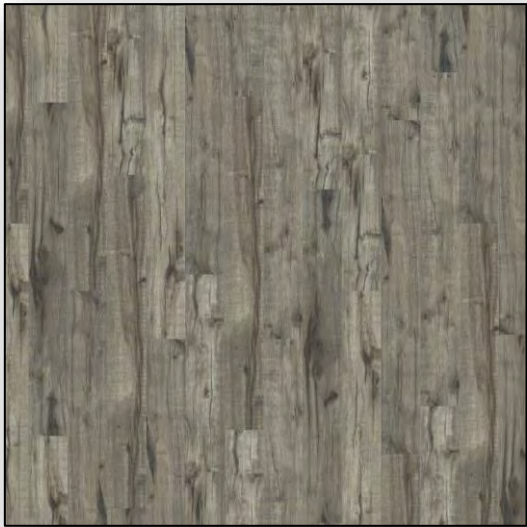
TREASURE COVE Weathered Hickory *Repel*