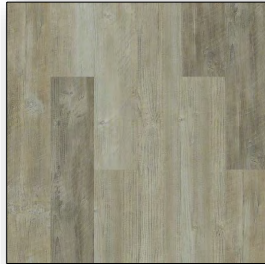
FLOORTE MOONLIT PINE Salvaged Pine *Waterproof*