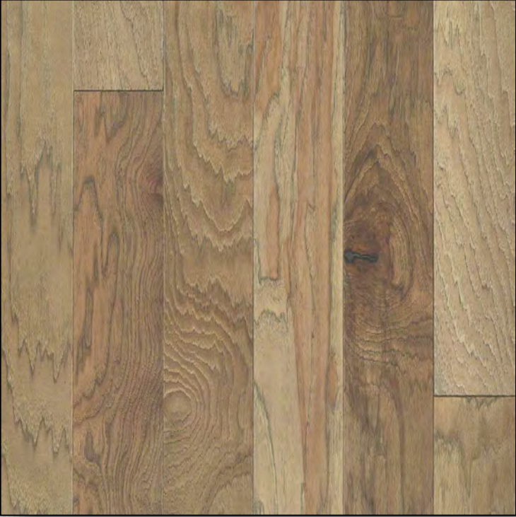
CAMPBELL CREEK BRUSHED Burlap