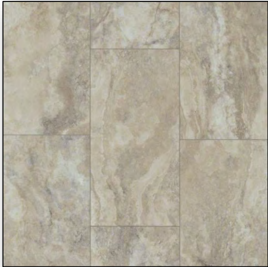
TILE (FAUX) FLOORTE URBAN ORGANICS Pebble *Waterproof*