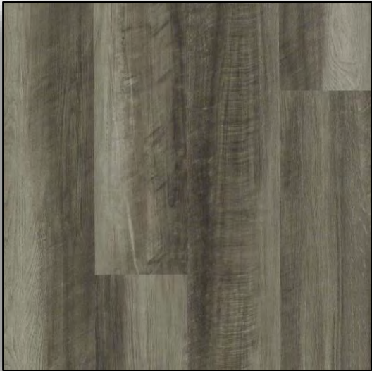
FLOORTE MARVELLA Oyster Oak *Waterproof*