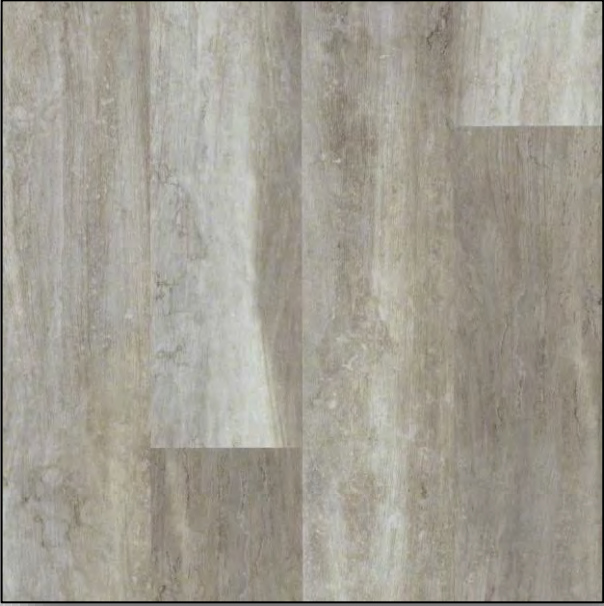
FLOORTE MARVELLA Shadow Oak *Waterproof*