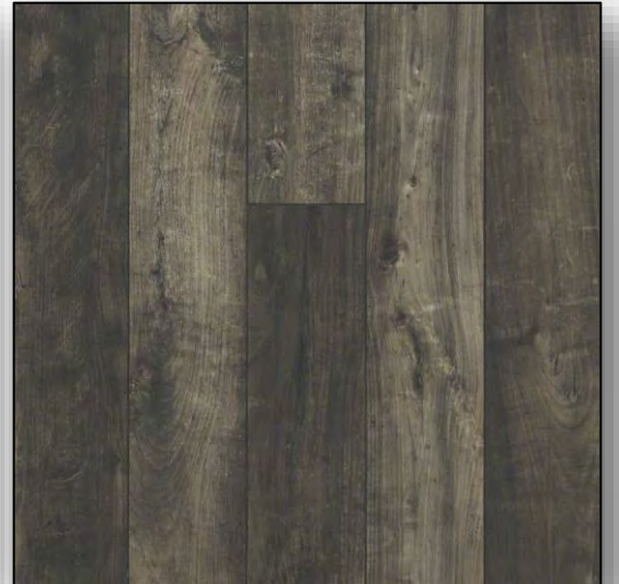
COLUMBIA Night Surf *Repel*