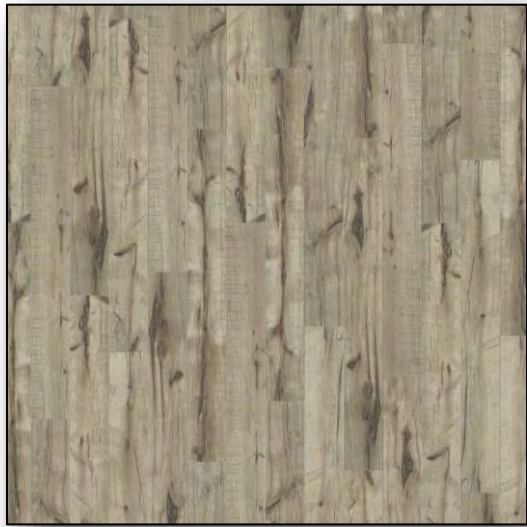
TREASURE COVE Golden Hickory *Repel*

*Product Availability is Subject to Change