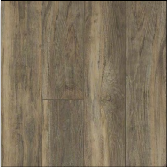
FLOORTE SUPINO HD PLUS Ardesia *Waterproof*