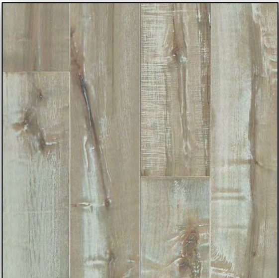
IMPRESSIONS MAPLE Celestial