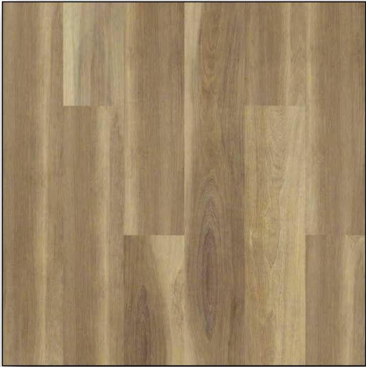
FLOORTE BARREL OAK Ravine Oak *Waterproof*