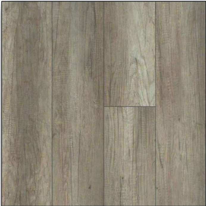
VARIATIONS Taupe Fusion