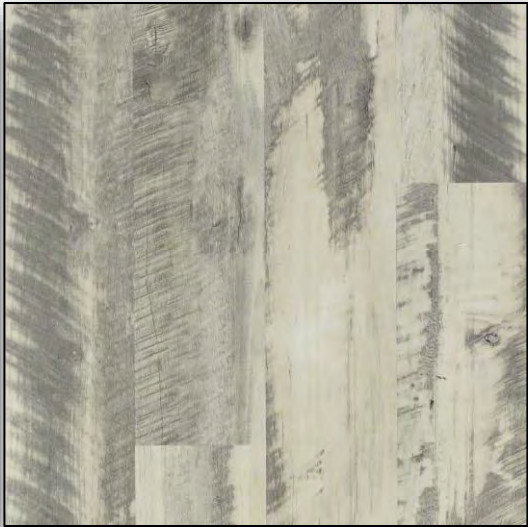
FLOORTE MARVELLA Gray Barnwood *Waterproof*