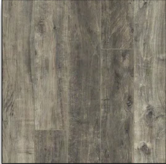
COLUMBIA Outpost Grey *Repel*