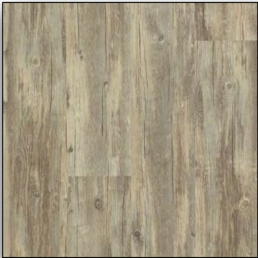
FLOORTE MARVELLA Wheat Oak *Waterproof*