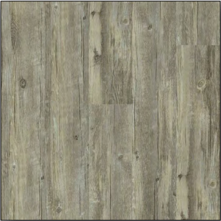
FLOORTE TORINO PLUS Roma *Waterproof*