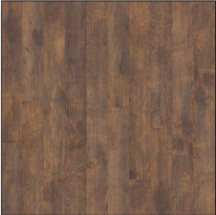
RESTORATION LIVING Wine Barrel

*Product Availability is Subject to Change