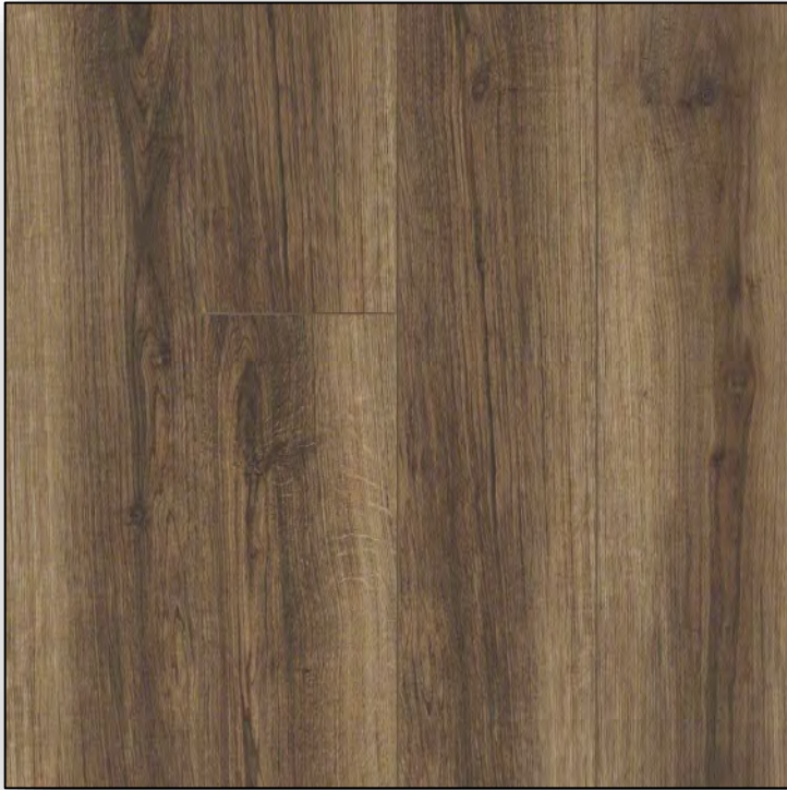
FLOORTE LAZIO PLUS Cacao *Waterproof*