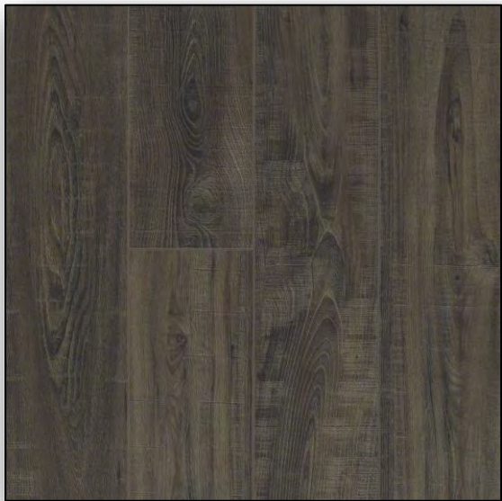
FLOORTE SUPINO HD PLUS Onice *Waterproof*