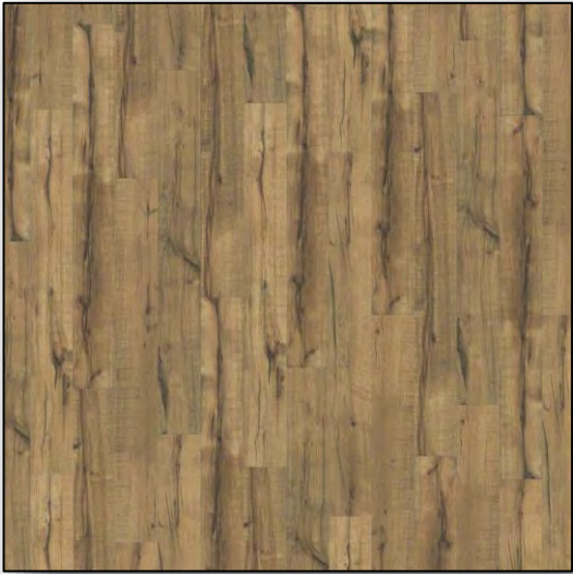
TREASURE COVE Baytown Hickory *Repel*