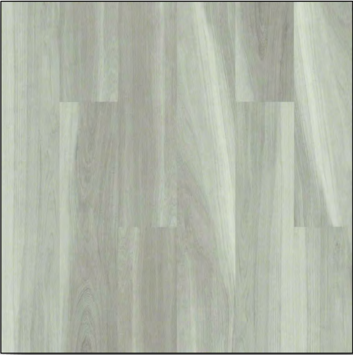
FLOORTE BARREL OAK Chestnut Oak *Waterproof*