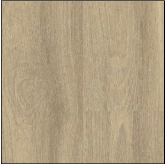
EXCALIBUR PLUS Landing