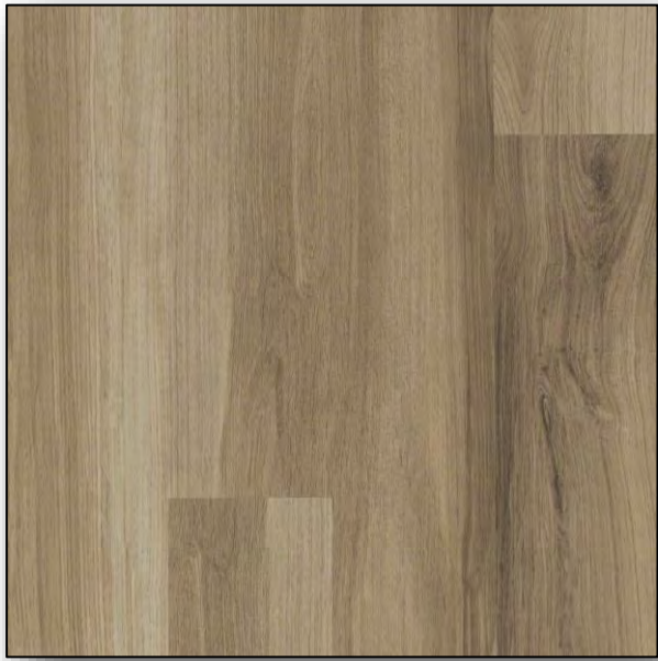
FLOORTE MARVELLA Almond Oak *Waterproof*