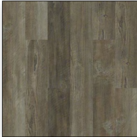
FLOORTE MOONLIT PINE Antique Pine *Waterproof*