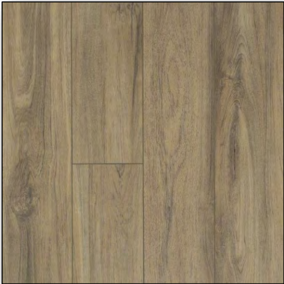
FLOORTE SUPINO HD PLUS Fiano *Waterproof*