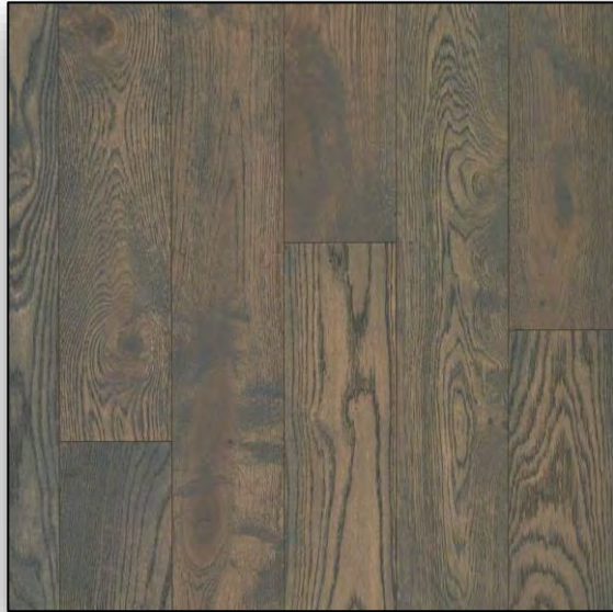
APEX OAK Granite