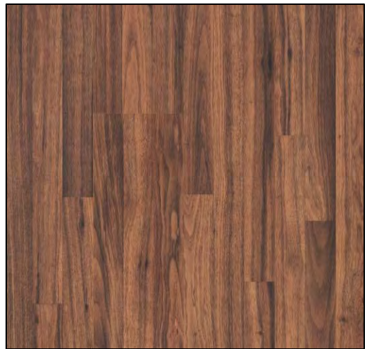
LIVING VIEW Kings Canyon