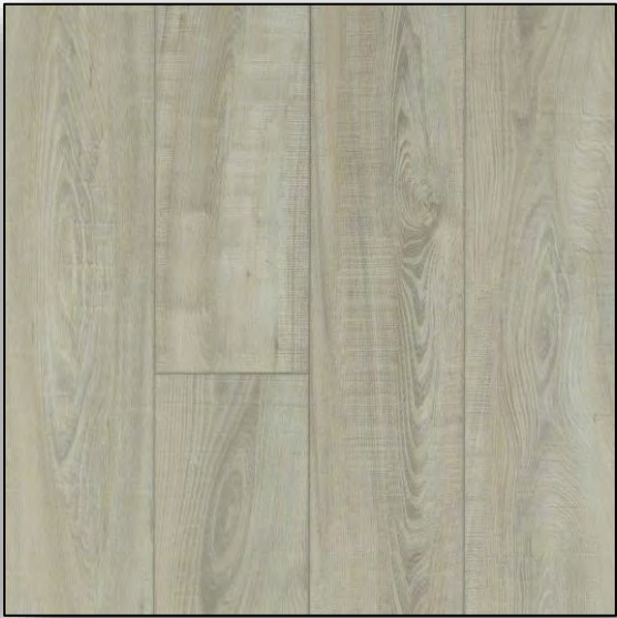
FLOORTE SUPINO HD PLUS Tufo *Waterproof*