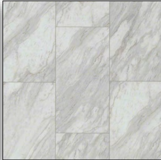
TILE (FAUX) FLOORTE URBAN ORGANICS Oyster *Waterproof*