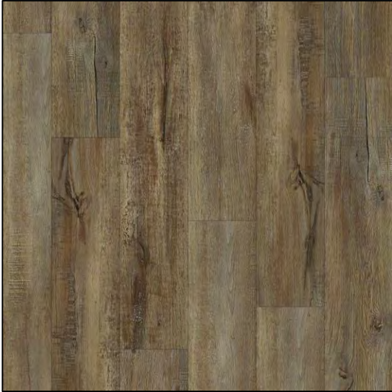
FLOORTE PRESTO Modeled Oak *Waterproof*

*Product Availability is Subject to Change