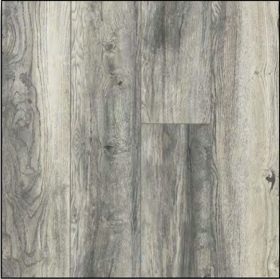
KINGSBAY Whispering Gray