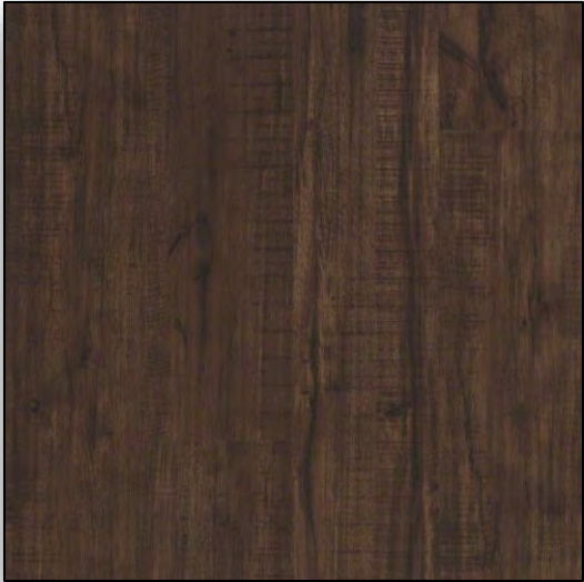
FLOORTE MARVELLA Umber Oak *Waterproof*