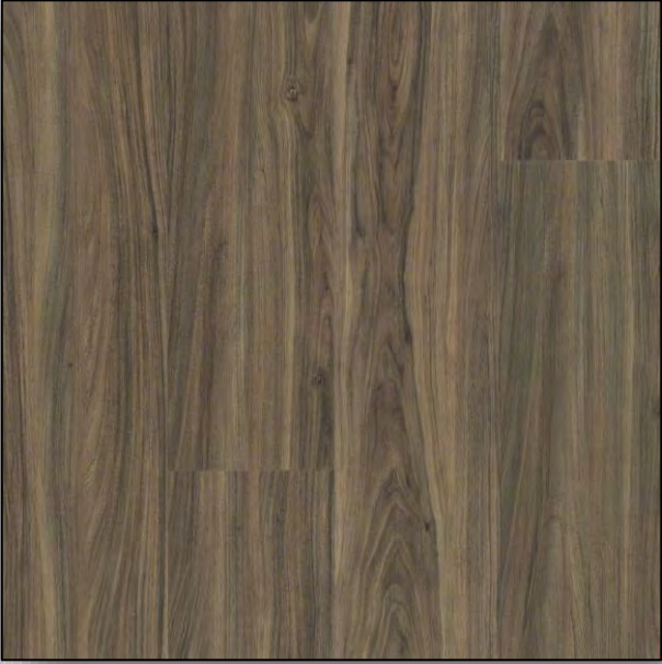
FLOORTE MARVELLA Cinnamon Walnut *Waterproof*