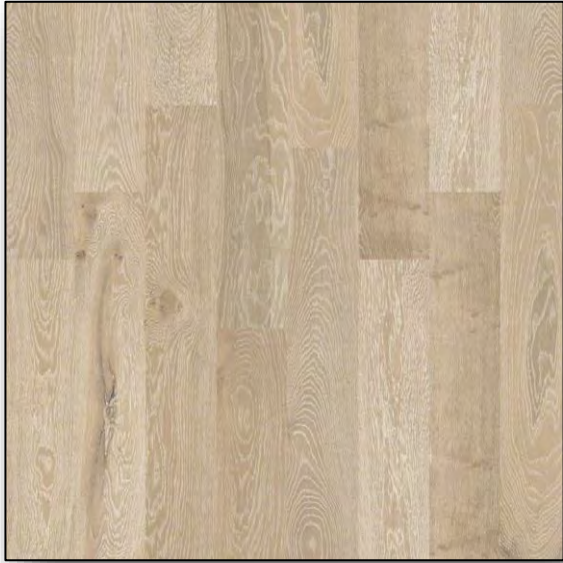
KINGSTON OAK Tower