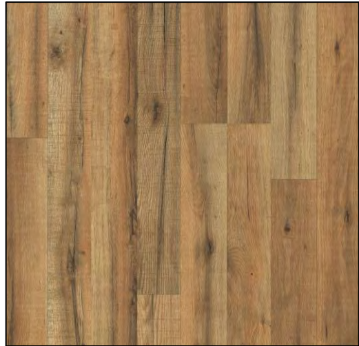
LIVING VIEW Orchard Oak