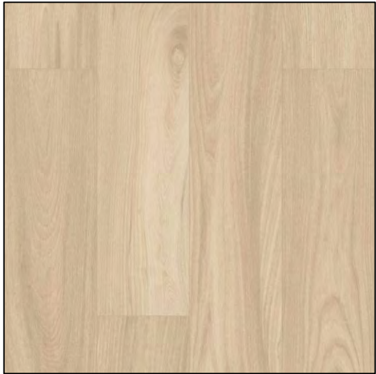
EXCALIBUR PLUS Halo

*Product Availability is Subject to Change