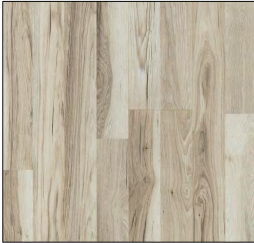
LIVING VIEW Starlight Hickory

*Product Availability is Subject to Change