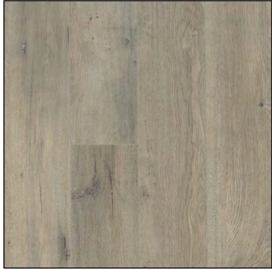
EXCALIBUR PLUS Alloy