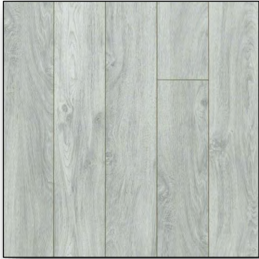
SOUTH BAY Skyline Grey *Repel*

*Product Availability is Subject to Change