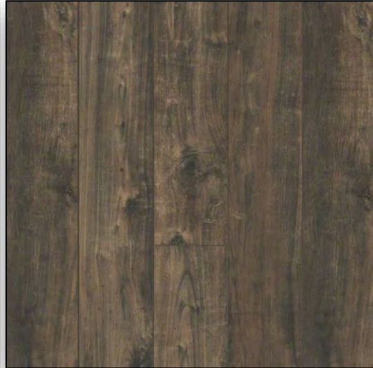
COLUMBIA Iconic Brown *Repel*