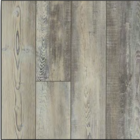
FLOORTE SUPINO HD PLUS Calcare *Waterproof*