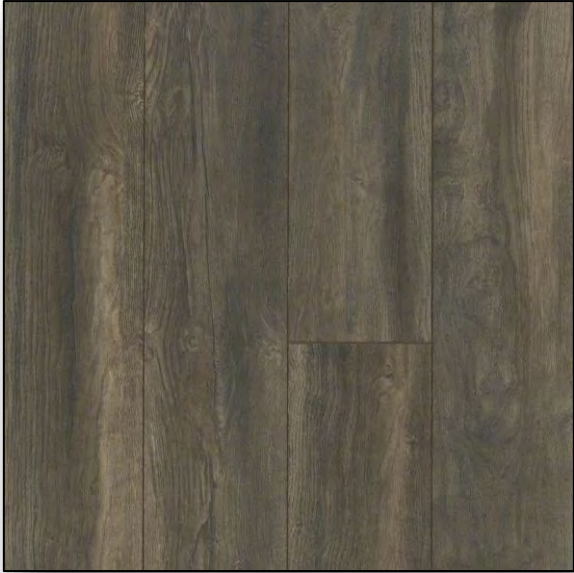
KINGSBAY Ancient Trail

*Product Availability is Subject to Change