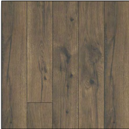
SOUTH BAY Cabana Brown *Repel*