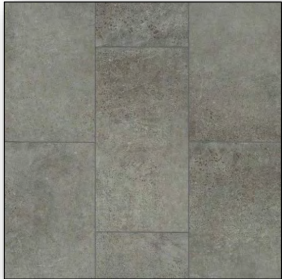
TILE (FAUX) FLOORTE URBAN ORGANICS Cobalt *Waterproof*