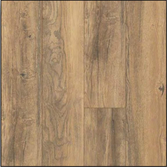
KINGSBAY Golden Sands