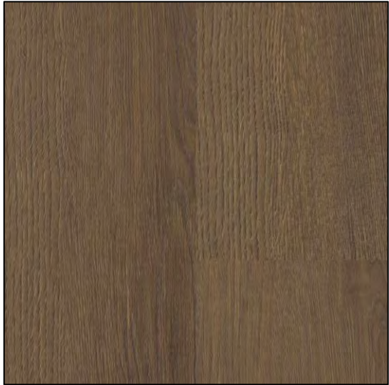
EXCALIBUR PLUS Tranquil

*Product Availability is Subject to Change